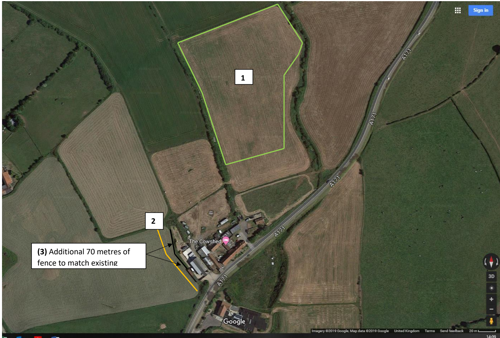
Fig 1. – Landscaping to correspond with above table – Source: Google imagery for illustrative purposes only