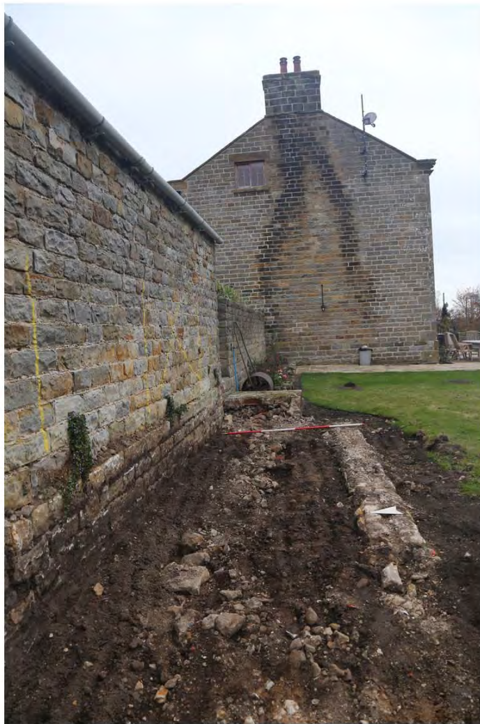
064_2000_2500_oblique outshot remains