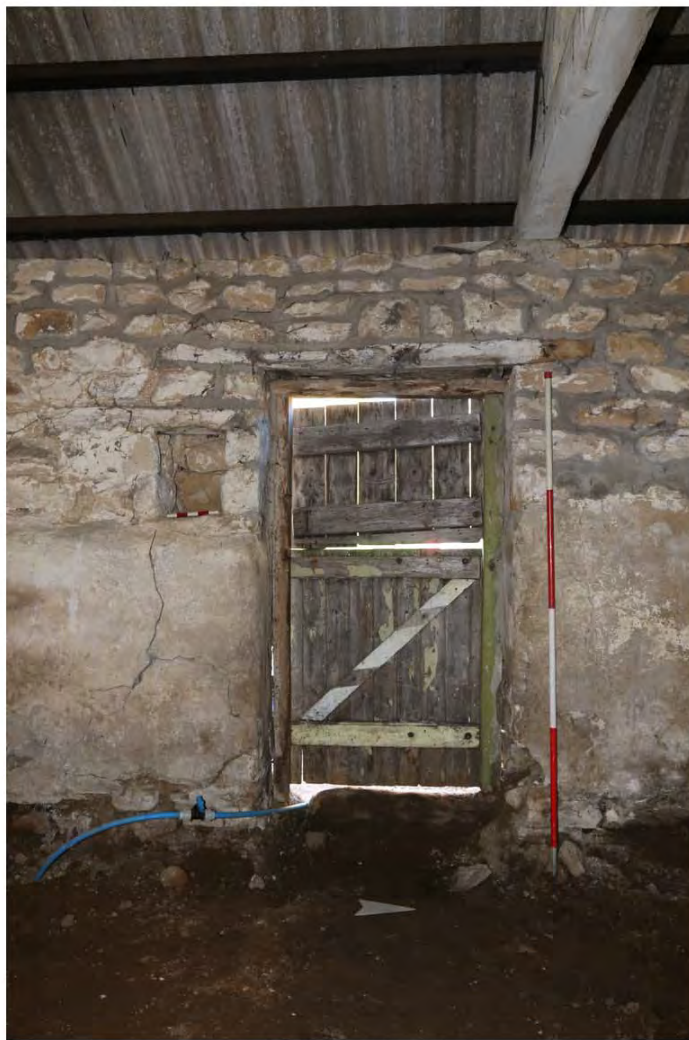
07_100_101 and 103-W_door