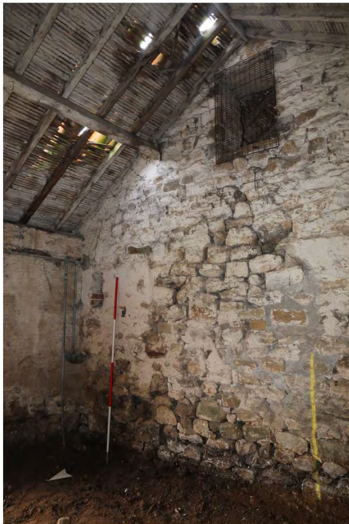
026_400_440_S_elev lk SE