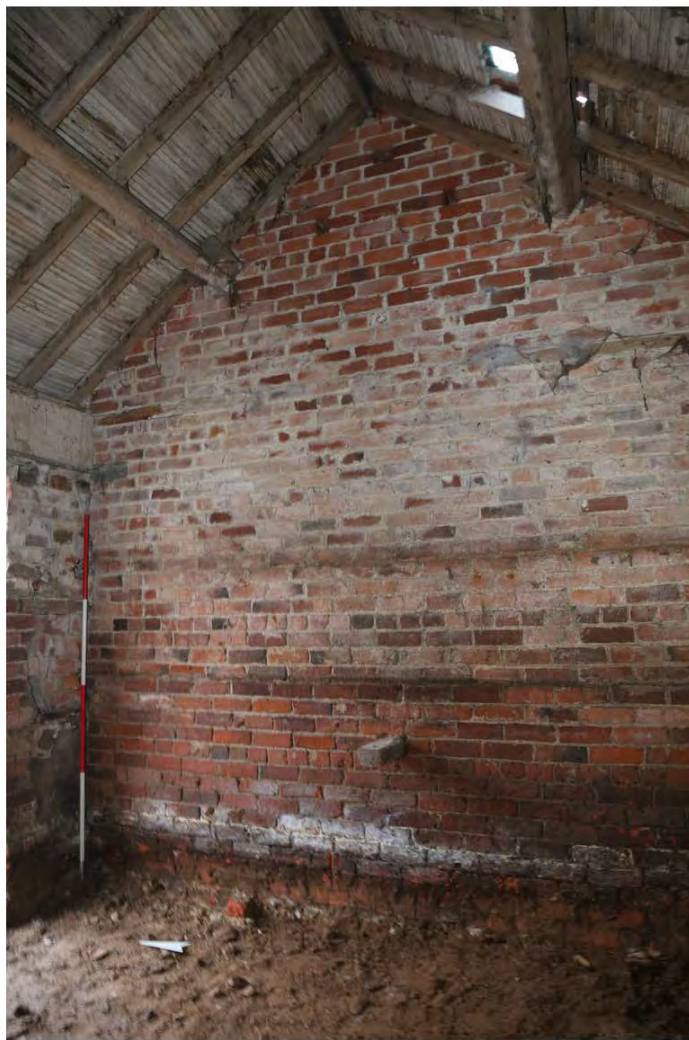
074_2000_2130_E_elev lk NE