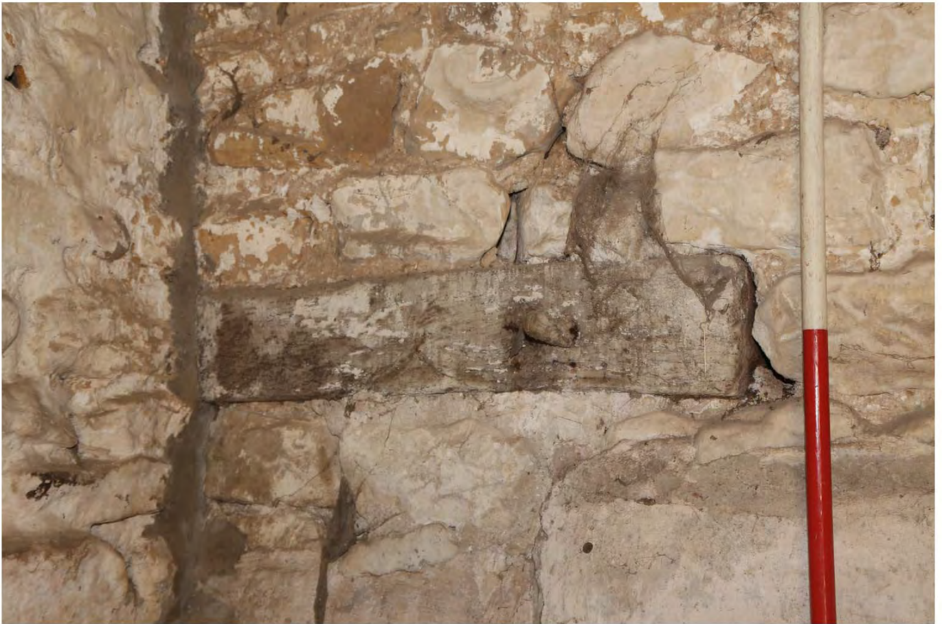
005_100_106-wooden tie and tack hook