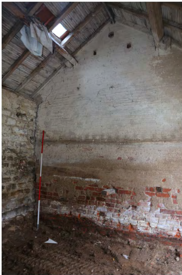
078_2000_2210_W_elev lk SW