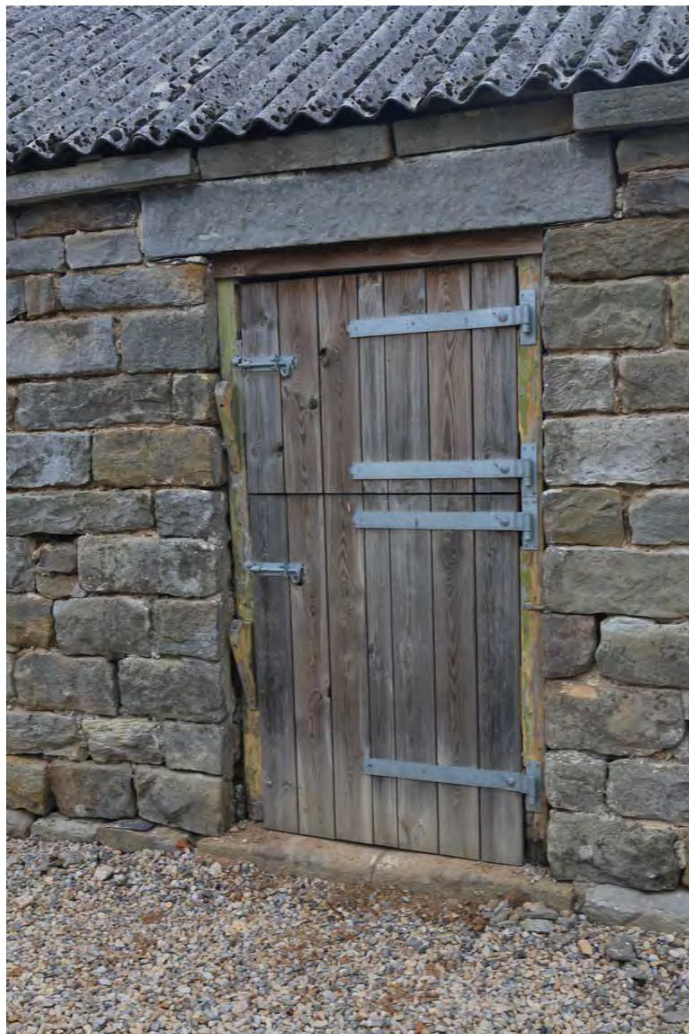
044_1010_202 EF-elev_door oblique