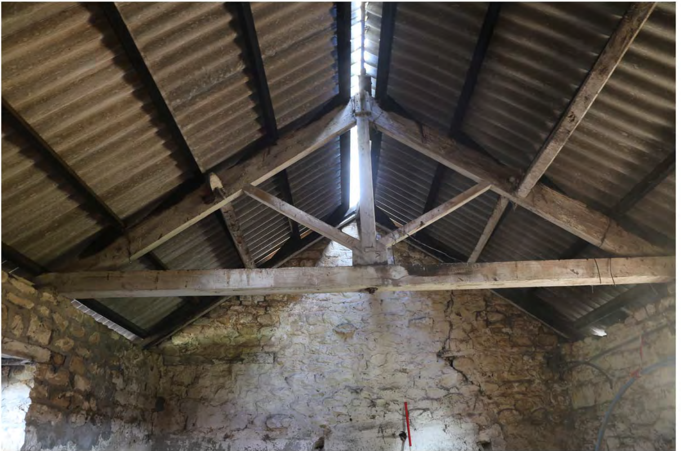
009_100_108_truss lk N