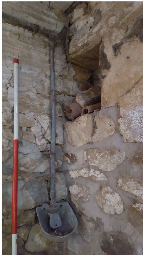
036_500_505_lamp niche SE corner