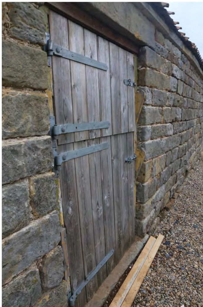
043_1010_302 EF-elev_door oblique