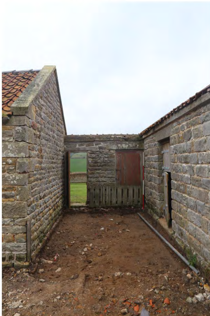
047_1050_boundary wall and door