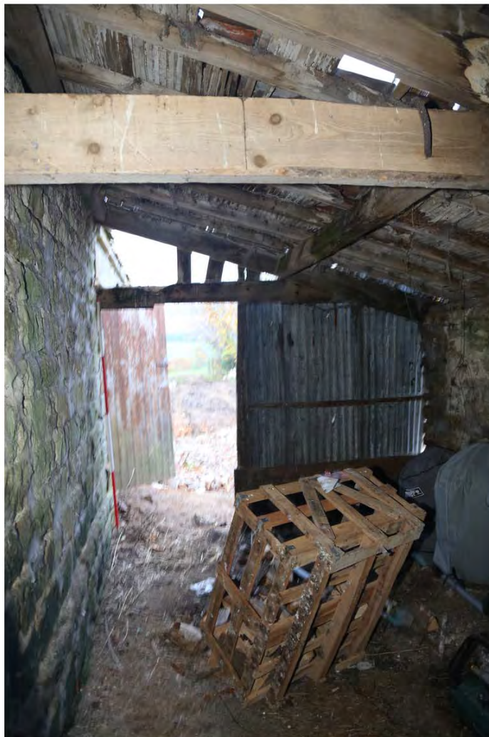
059_600_outshot interior lk S