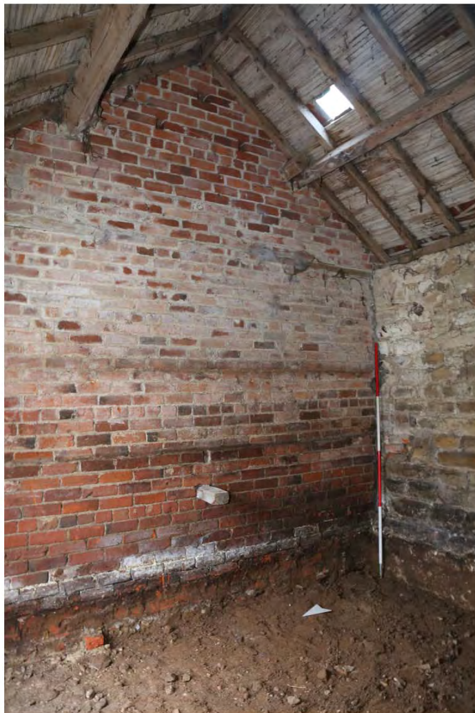
075_2000_2130-2103_E_elev lk SE