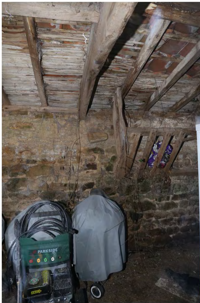
058_600_outshot interior lk NW