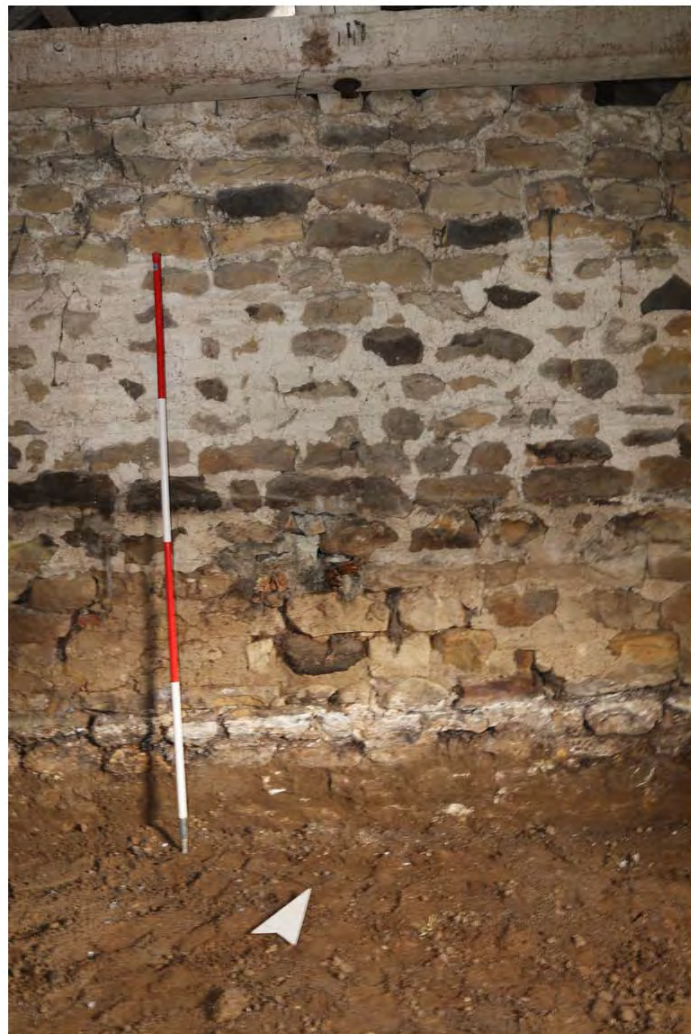
020_300_304_evidence of feeding trough