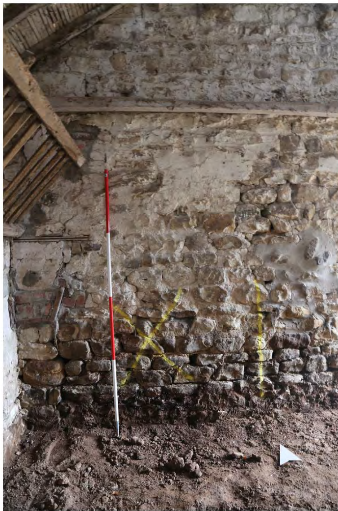
029_400_403_feeding trough fittings