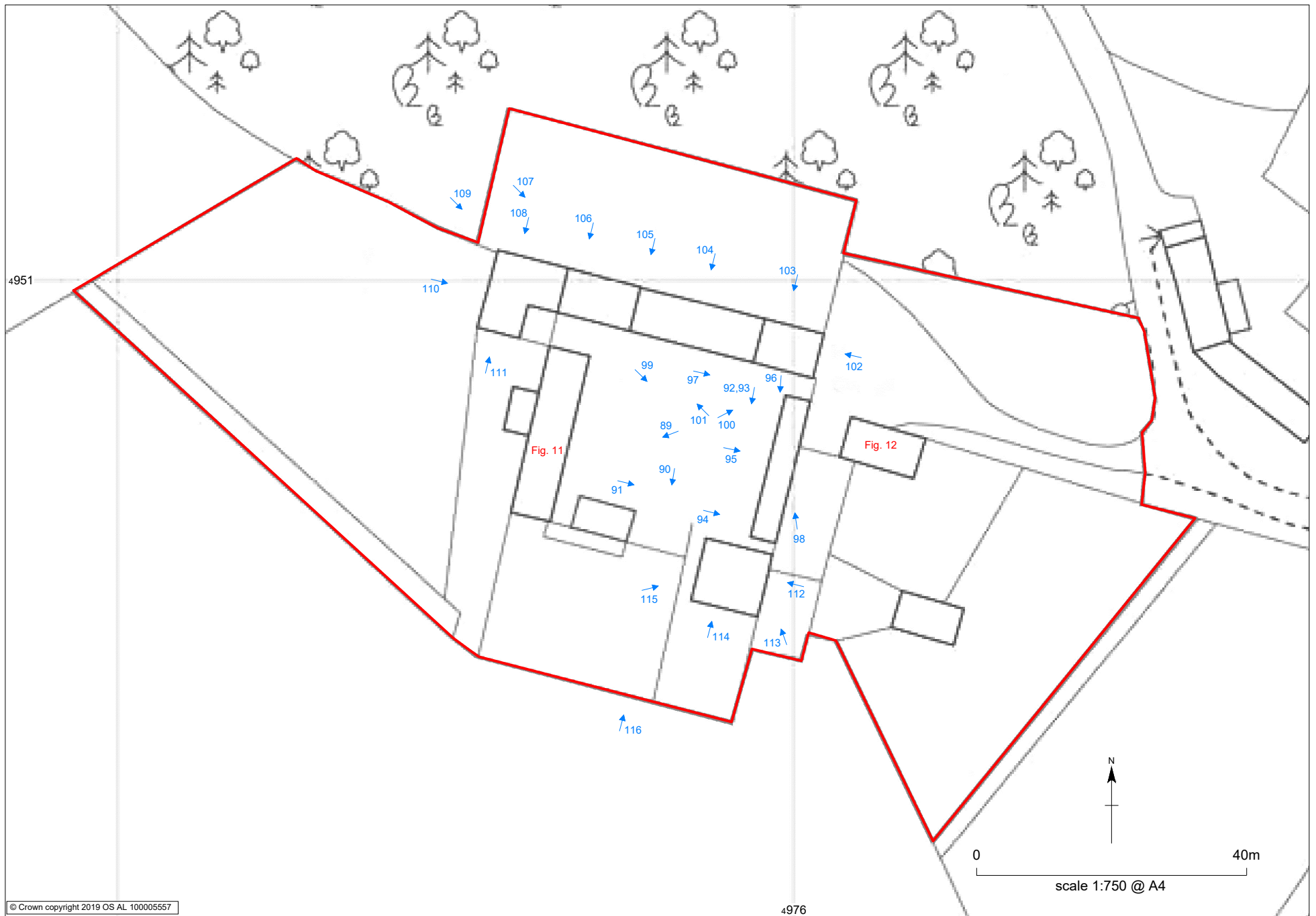
Thirley Cotes Farm: photograph locations