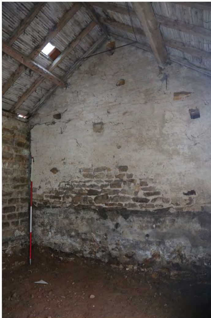
071_2000_2110_W_elev lk SW