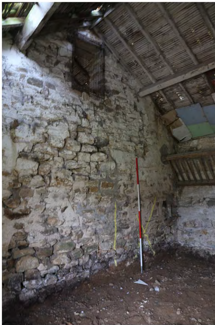
027_400_440_S_elev lk SW