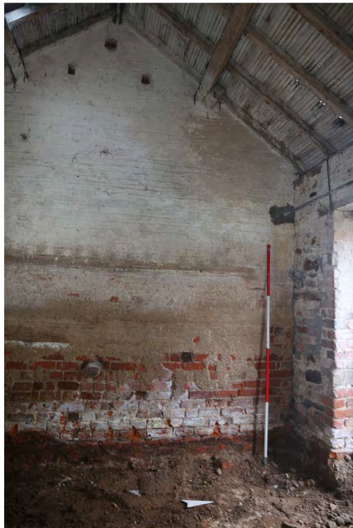
077_2000_2210_W_elev lk NW