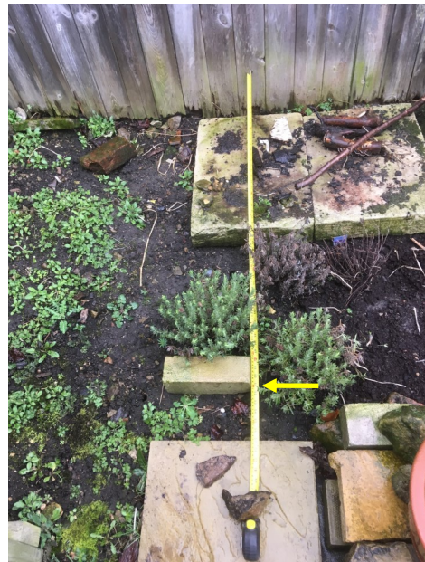
Measuring extent of proposed flat roof extension to studio: 1.3 m from existing wooden shed