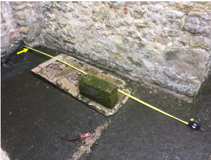
Side of Gables extension, with small corner pillar