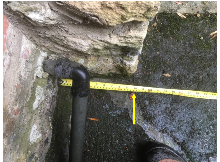
Measurement of pillar = 0.25 m