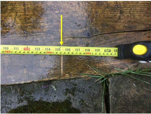
Extent of proposed single storey extn, (6.0 m from house) 1.93 m from Gables extn