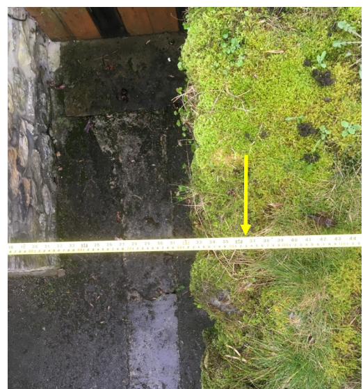
Extent of proposed 2 storey extension, (4.0 m from house) 0.93 m from the Gables extn.