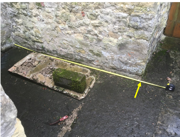
Measuring Gables extension, distance from pillar = 2.82 m. Total length from house = 3.07 m