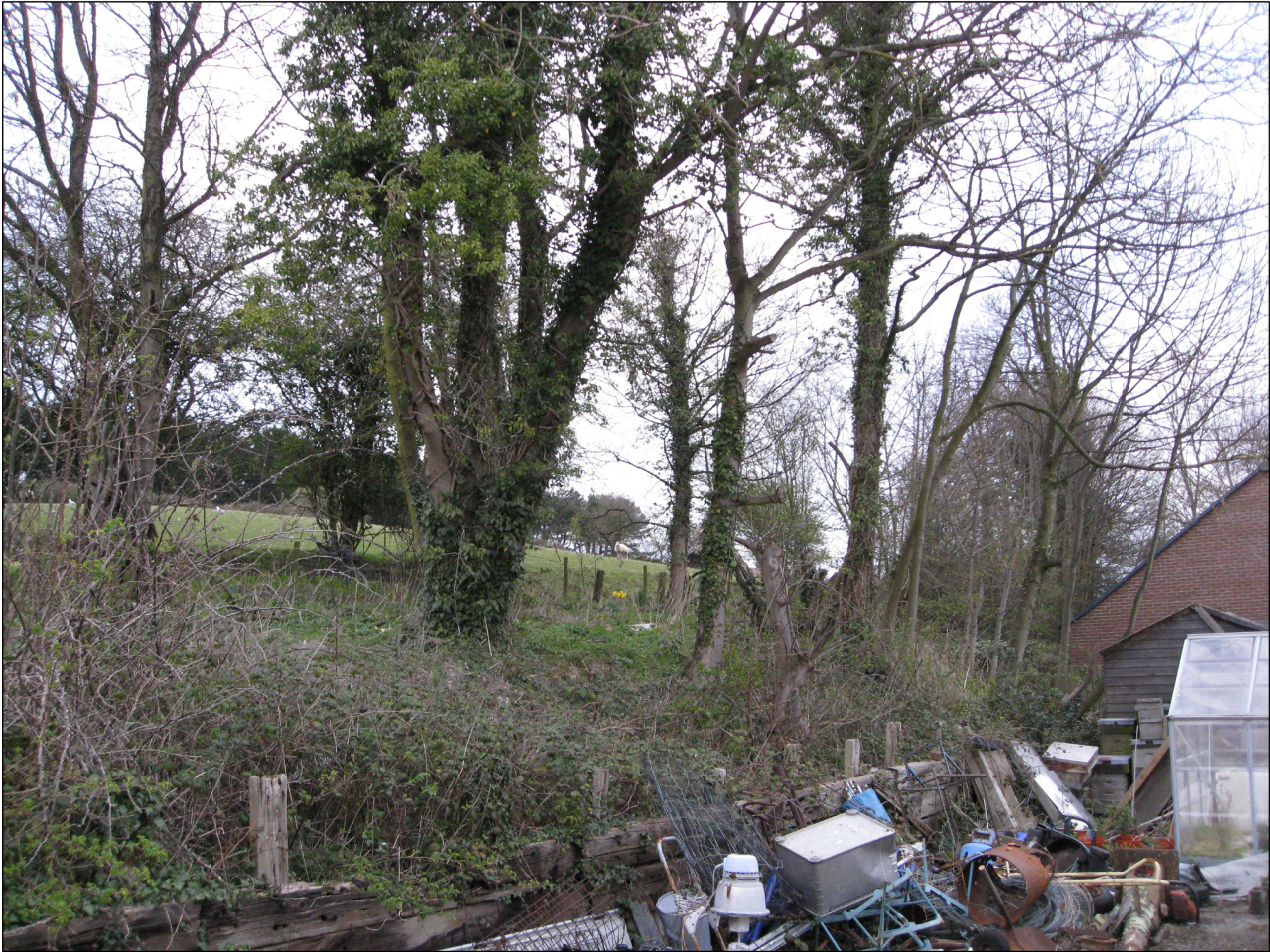
COAL YARD, STATION ROAD, ROBIN HOODS BAY NYM/2019/0175/FL