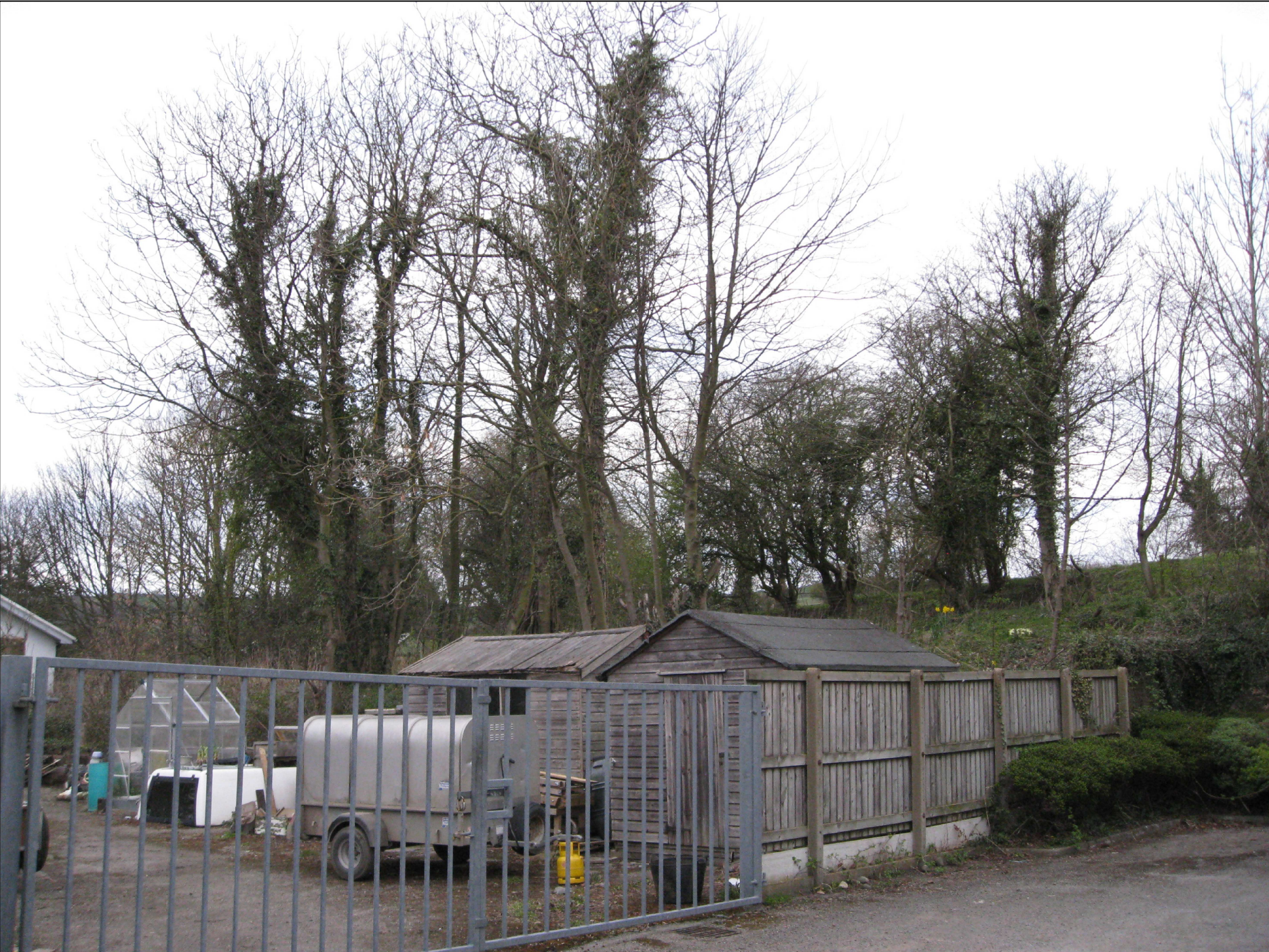
COAL YARD, STATION ROAD, ROBIN HOODS BAY NYM/2019/0175/FL