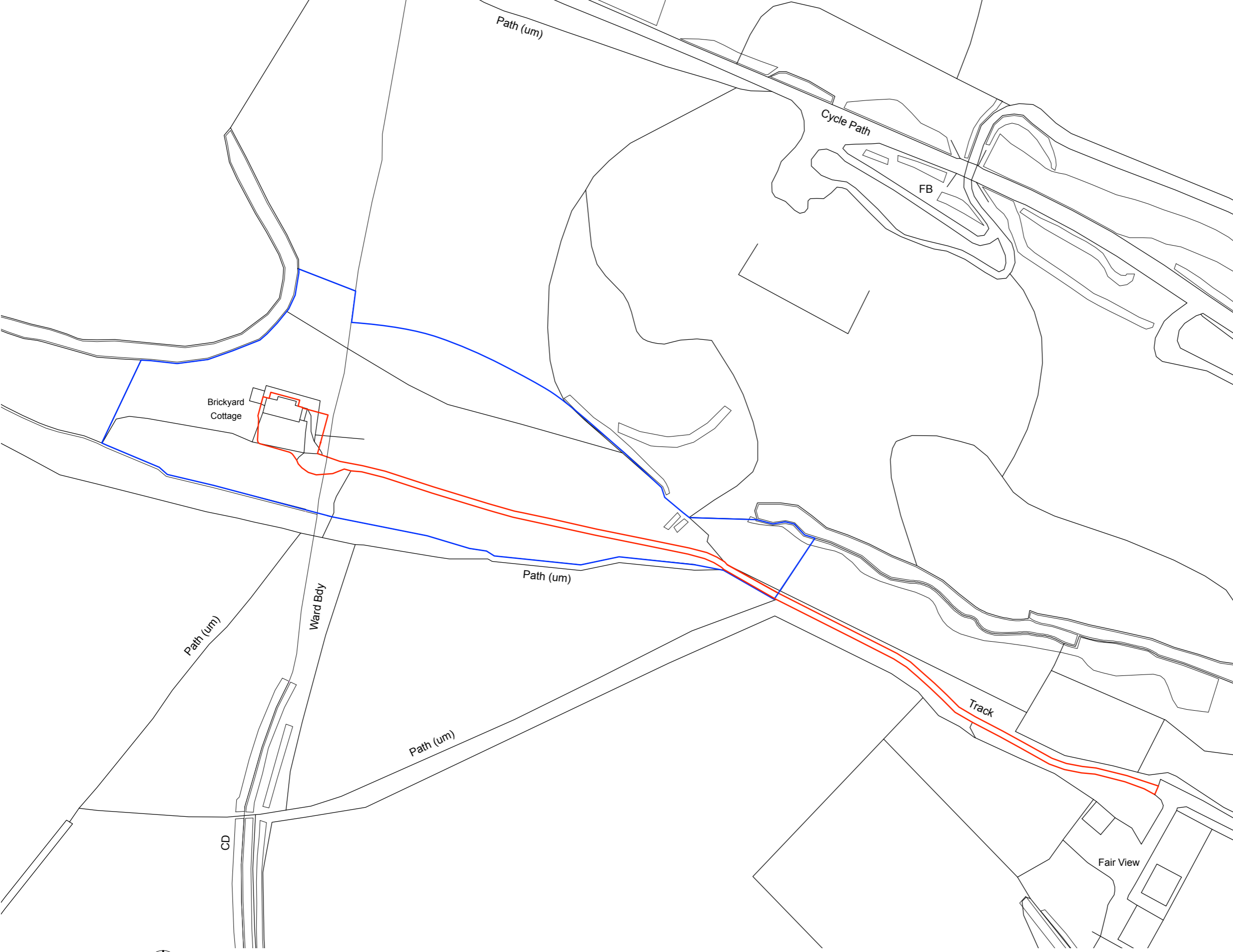
Site Location plan Scale 1:1250