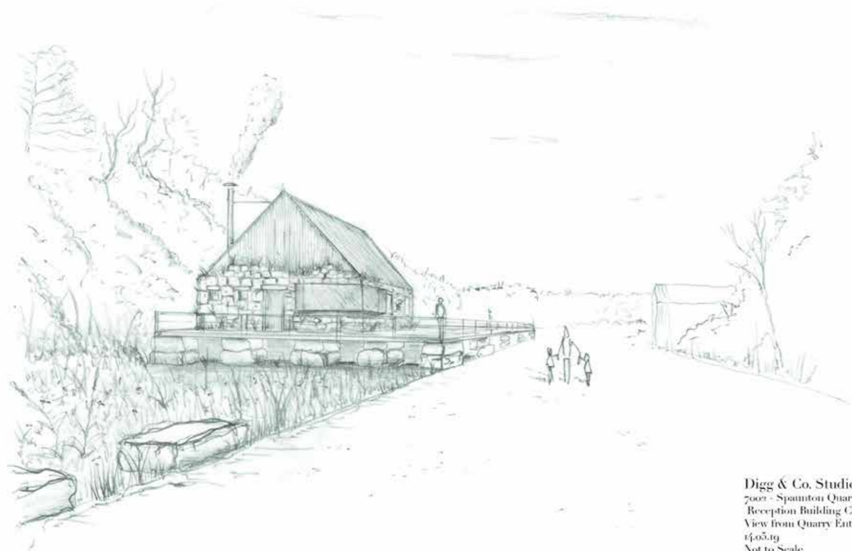
Digg & Co. Studio 7002 - Spanton Quarry Reception Building Concept 3 View from Quarry Entrance 14.05.19 Not to Scale