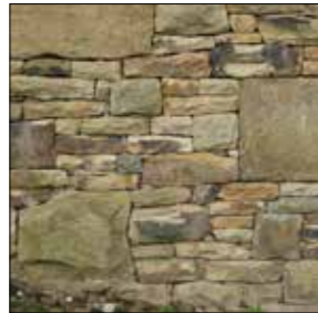
LIMESTONE DRYSTONE EFFECT