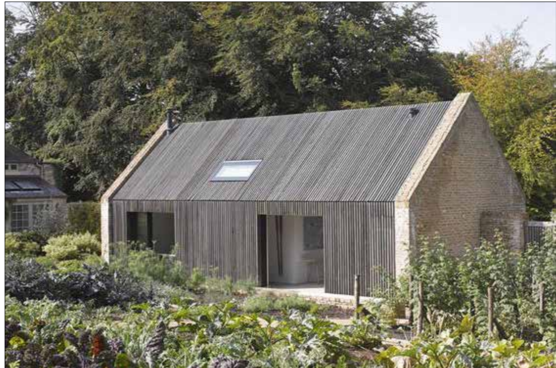
Contemporary cabins set in natural landscapes. Local vernacular with modern detailing