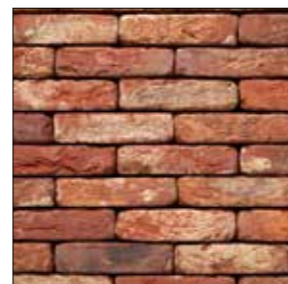
BRICK PARAPET GABLE