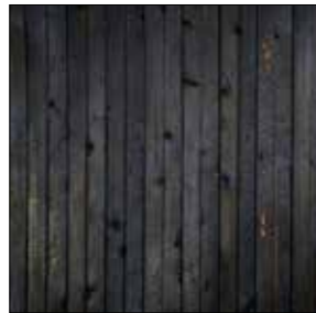
CHARRED LARCH (or similar)