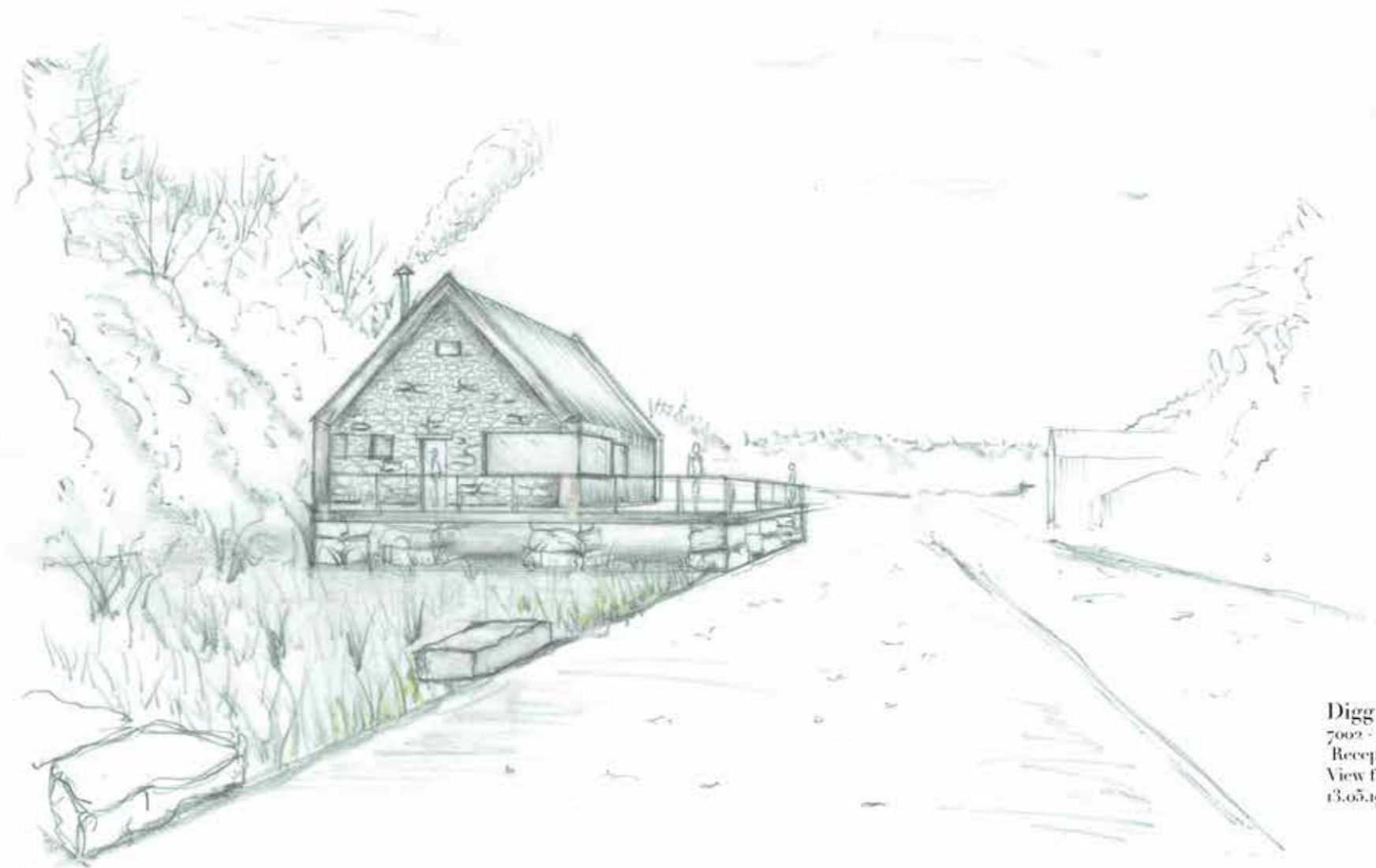
Digg & Co. Studio 7002 - Spaunton Quarry Reception Building Concept View from Quarry Entrance 13.05.19