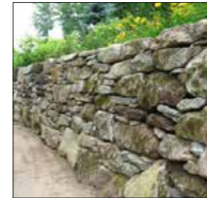
BOULDER COURSE LIMESTONE