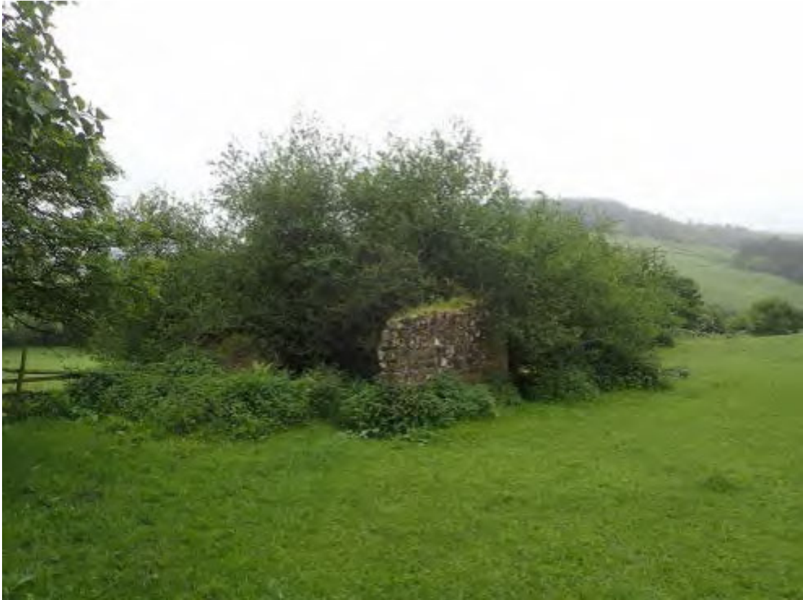
NYM/2019/0353/OU "Thorn House"