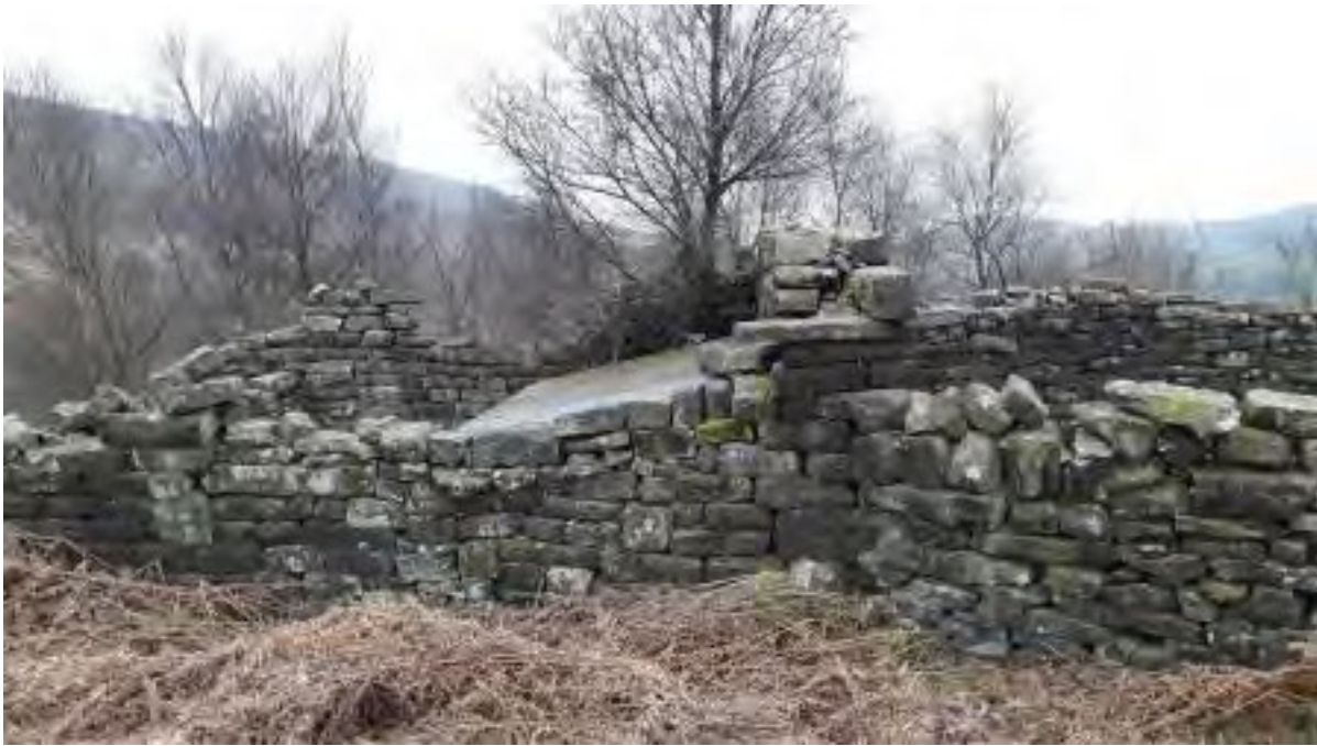
NYM/2019/0355/OU "Red House"