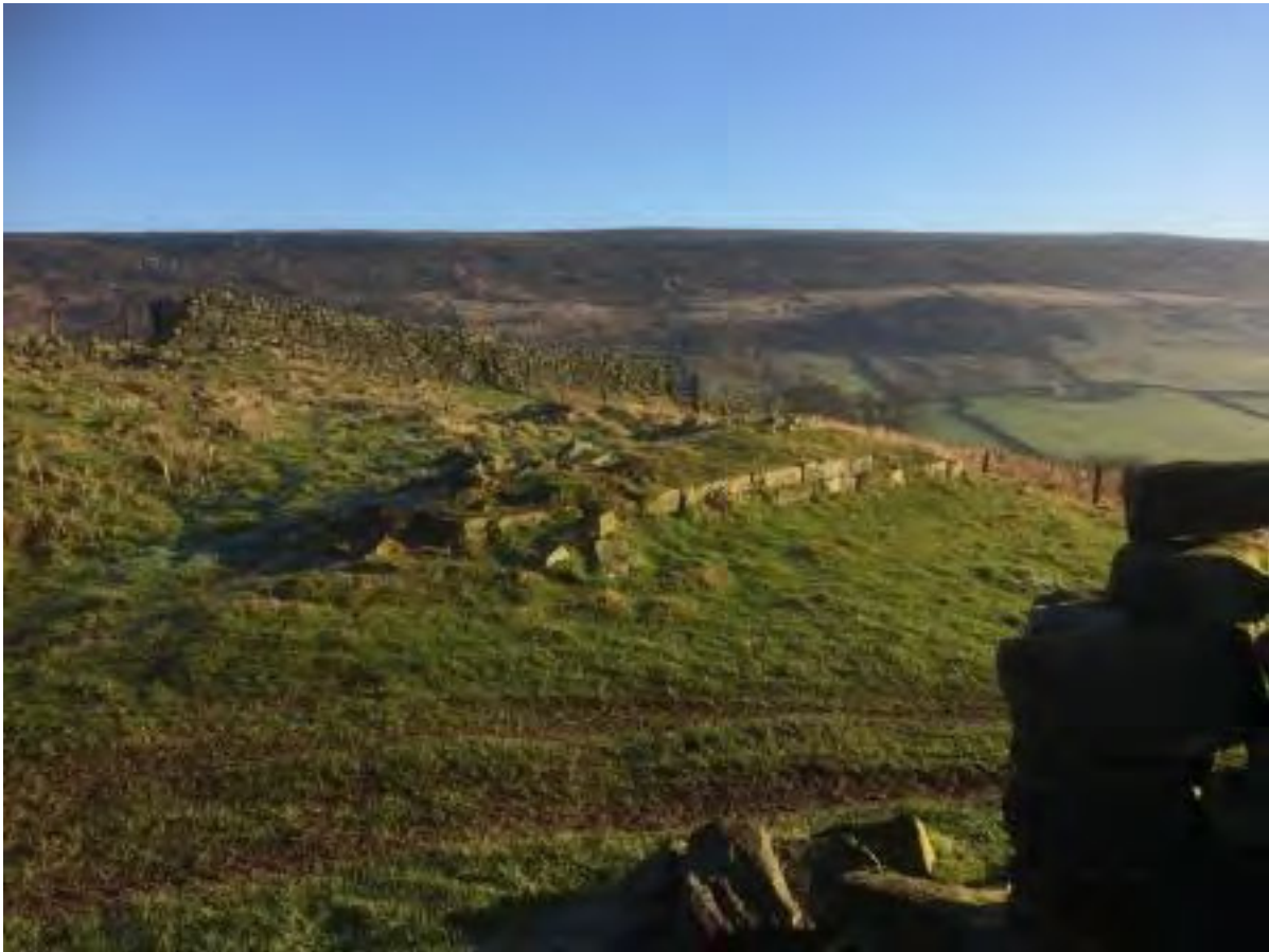
NYM/2019/0356/OU "West Northdale"