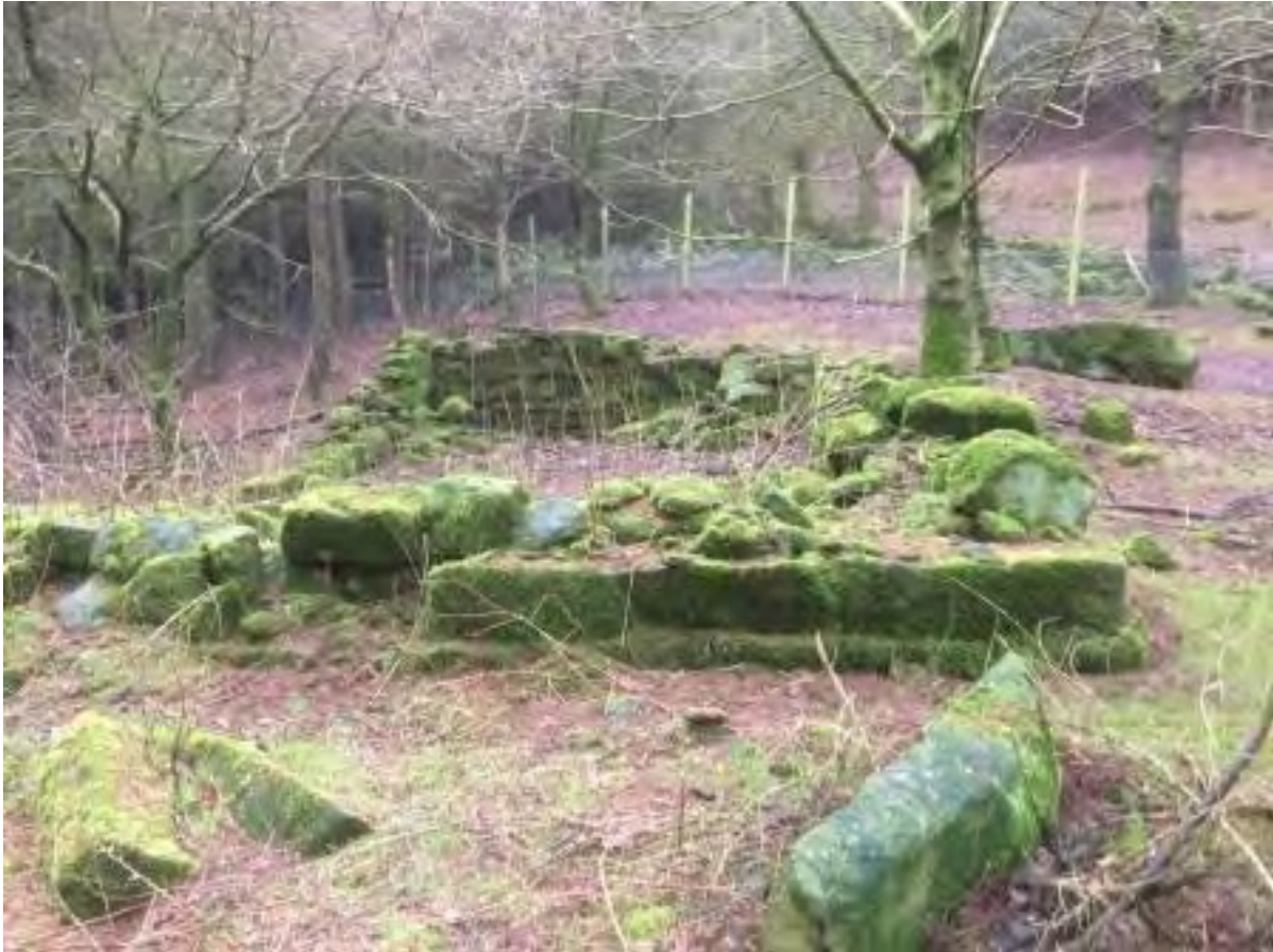
NYM/2019/0359/OU “Bog House”