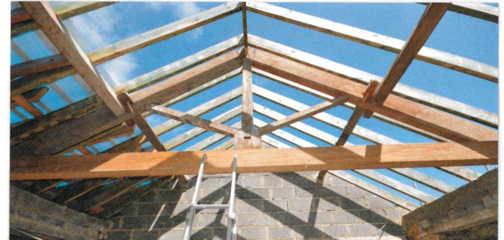
TRUSS 2 - WALNUT