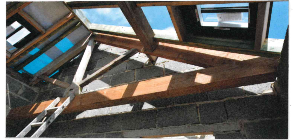
TRUSS 1 - WALNUT