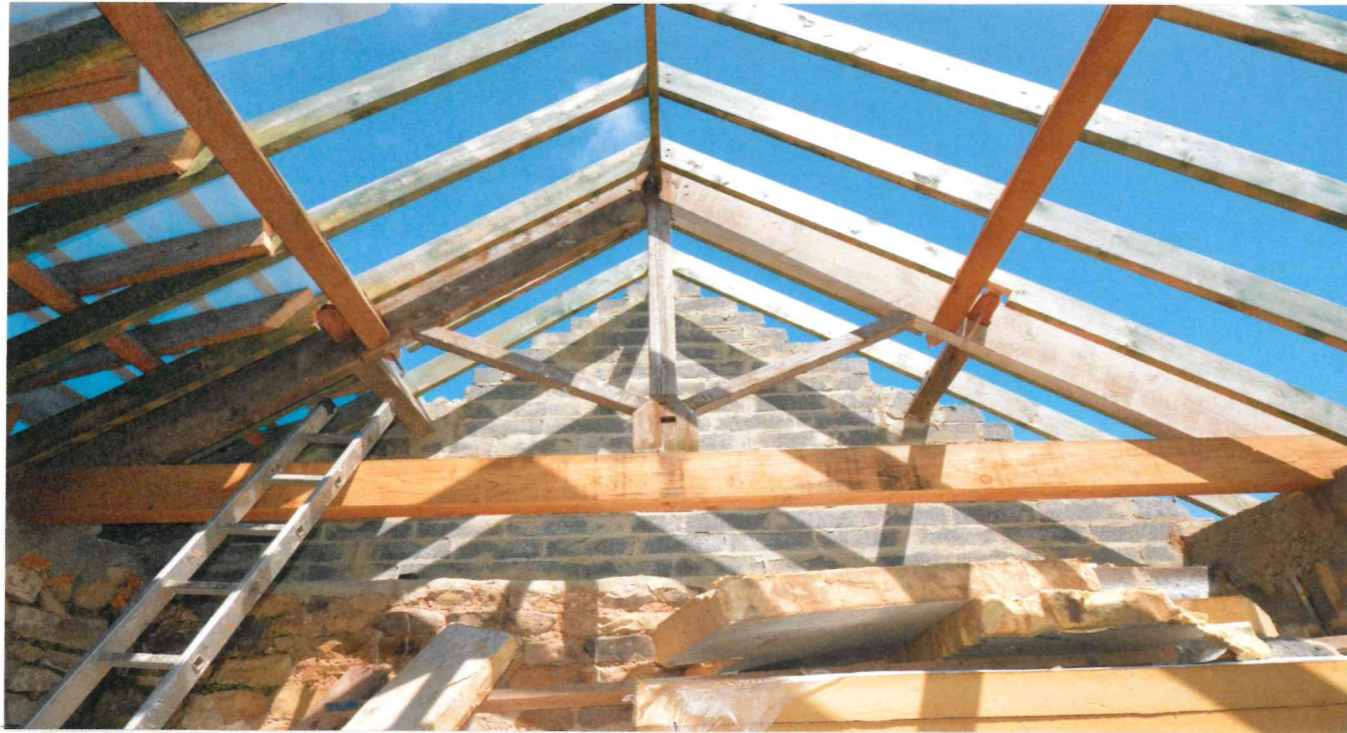
TRUSS 3 - MULBERRY