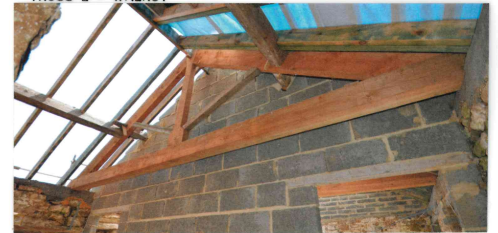
TRUSS 4 - MULBERRY