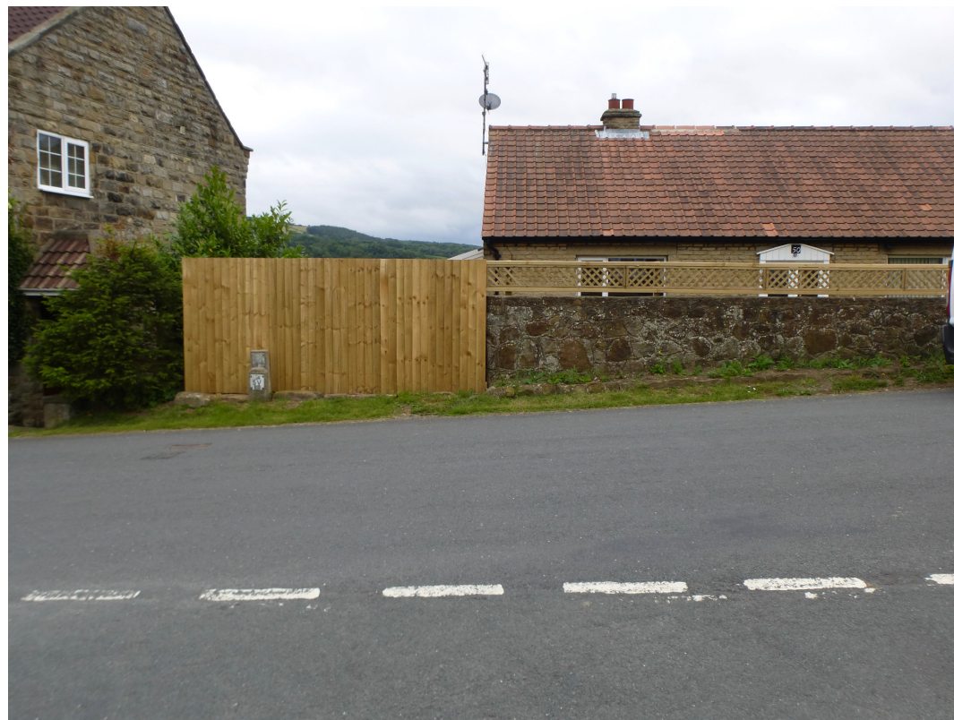
E l e v a t i o n s t o I b u r n d a l e L a n e

Existing rubble stone boundary wall. Decorative timber detail to wall top. Natural clear finish.