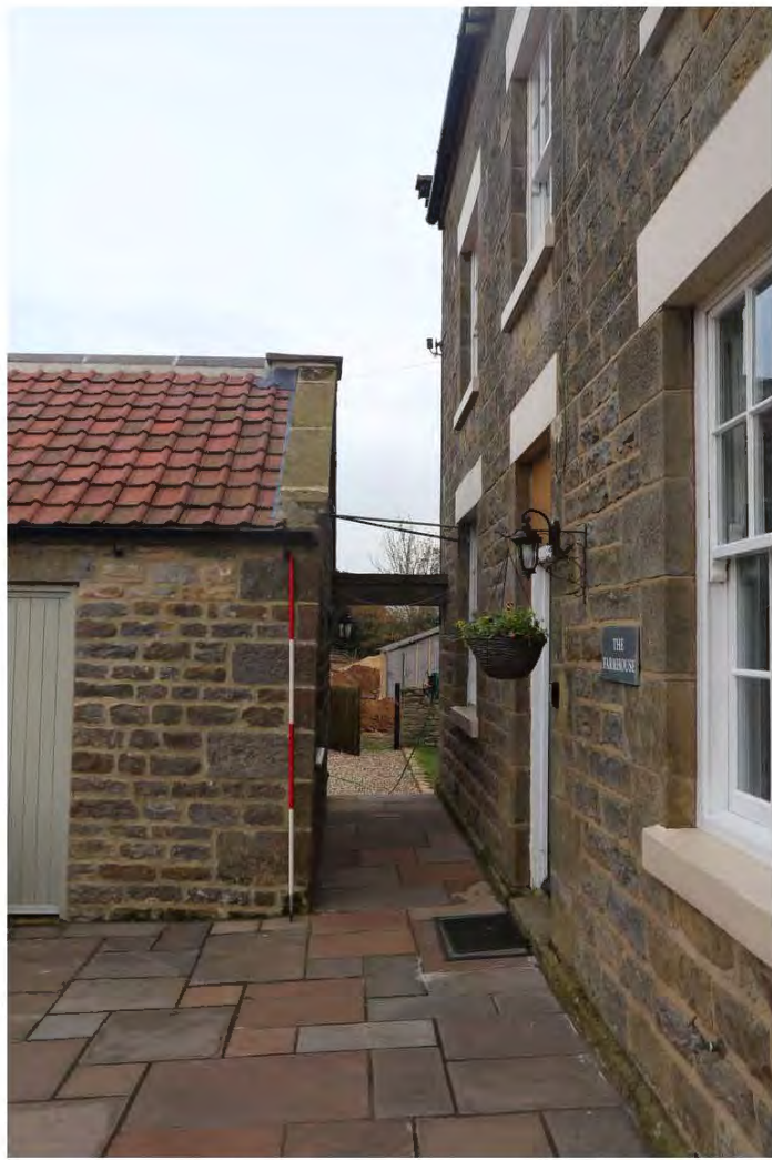
094_Gen_view - passgae bet house and E Range