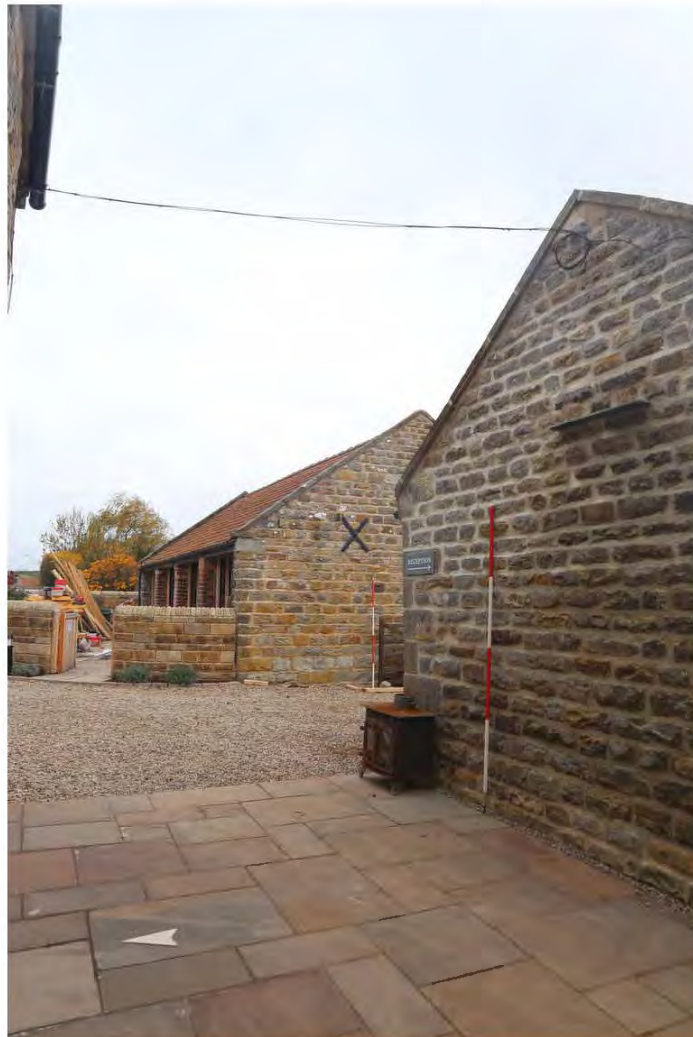
097_Gen_view - NF elev of E range with cart shed