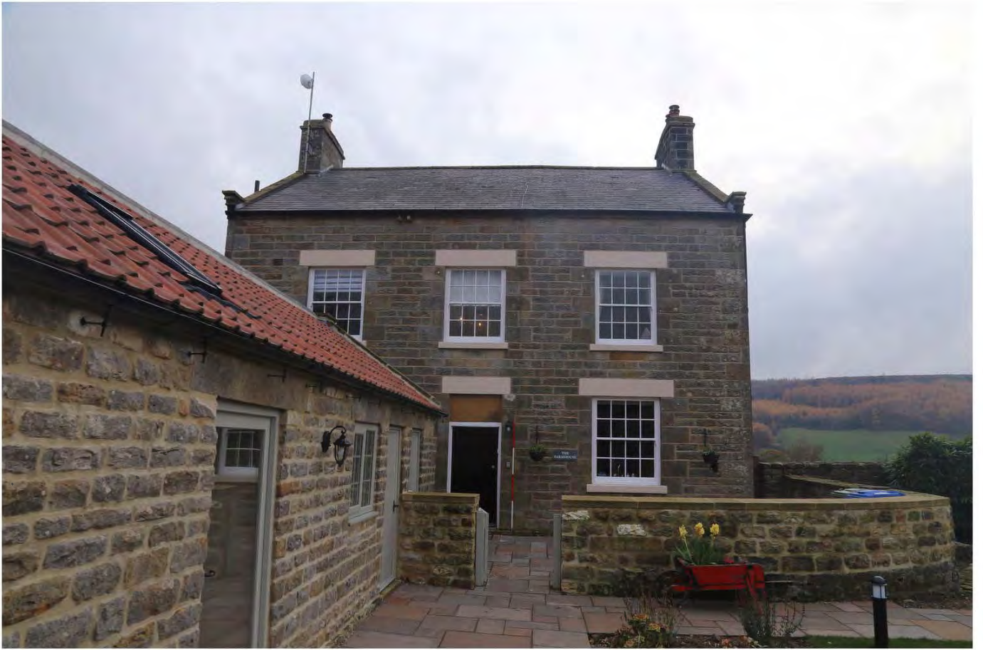
092_Gen_view -NF elev of house