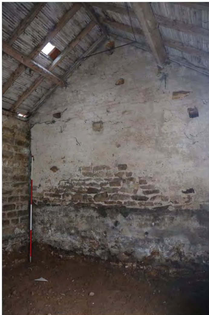
071_2000_2110_W_elev lk SW