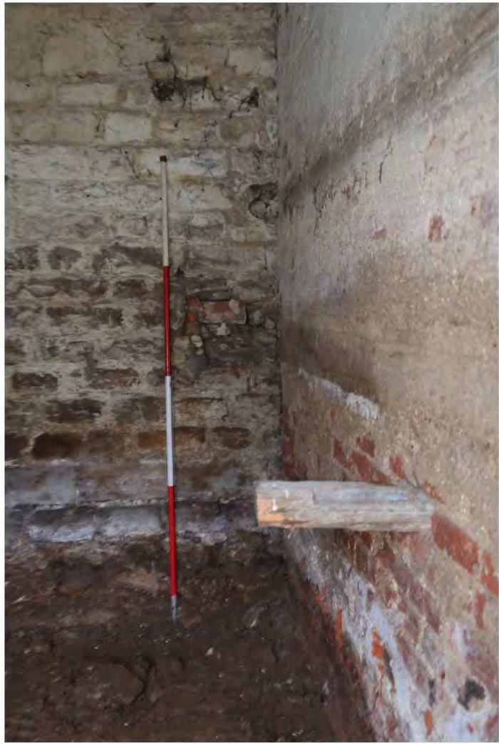
082_2000_2240-2103_trough W wall