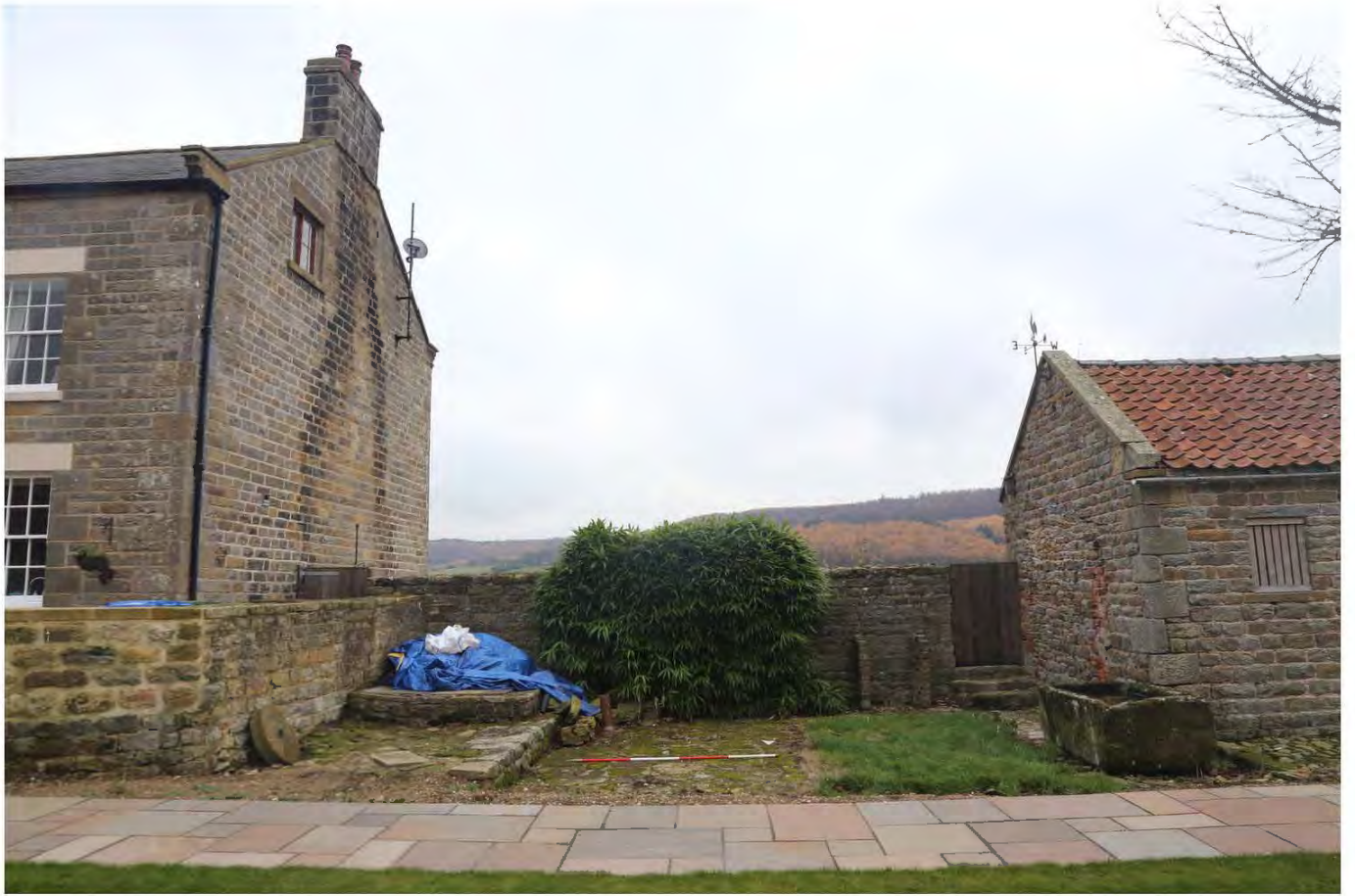
090_Gen_view area bet. house and stable - building footprint lk SW