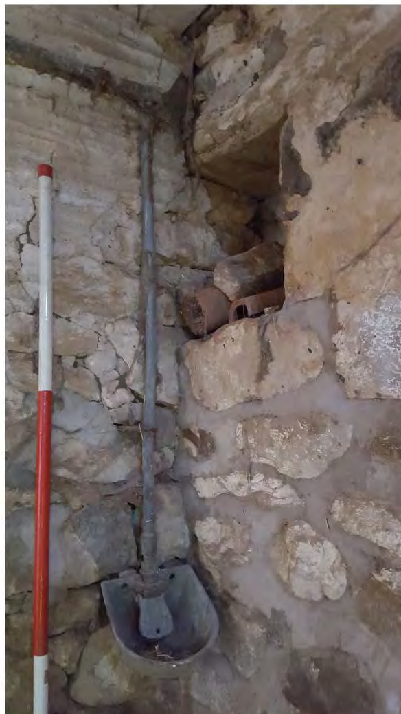
036_500_505_lamp niche SE corner