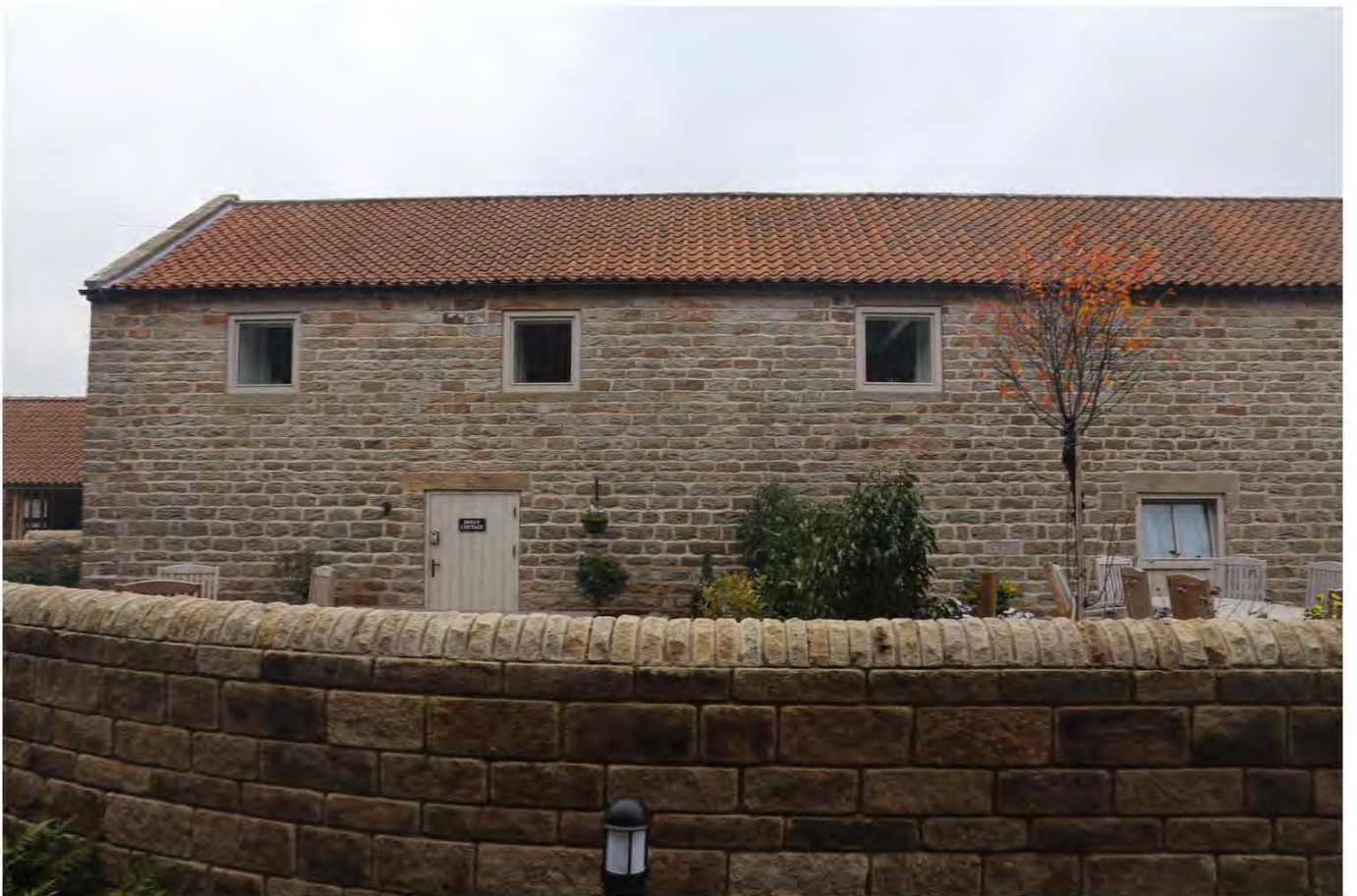
103_Gen_view -NF elev of N range E end