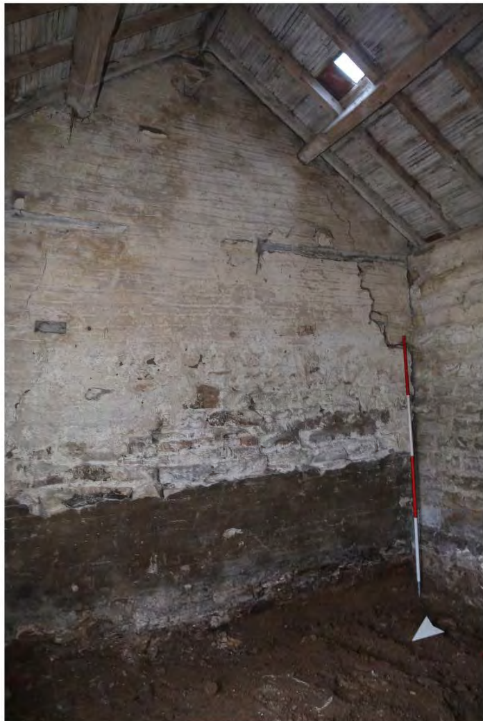
081_2000_2230_E_elev lk SE