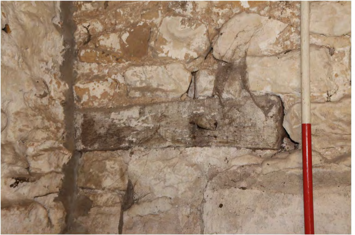
005_100_106-wooden tie and tack hook