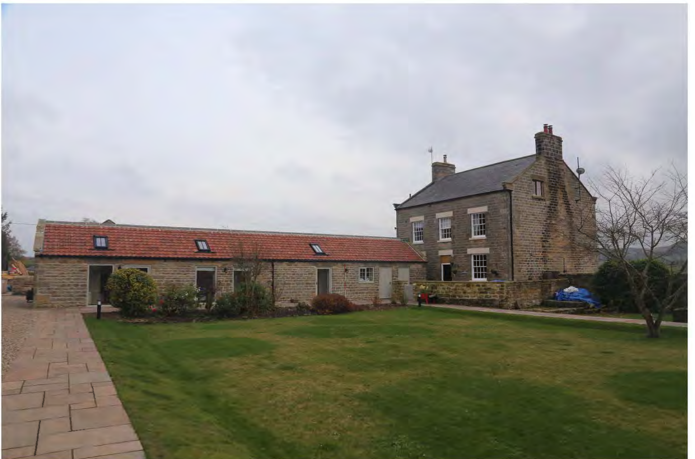
099_Gen_view - of E range and house lk SE