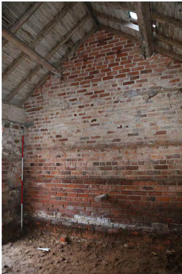
074_2000_2130_E_elev lk NE