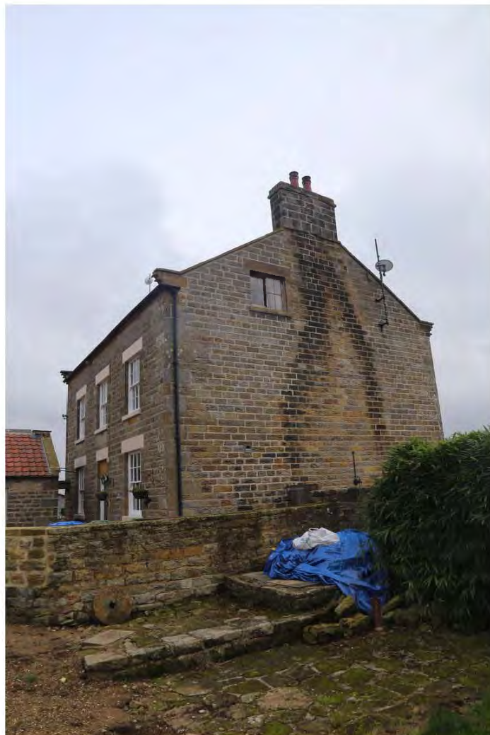
091_Gen_view of W gable of house lk SW