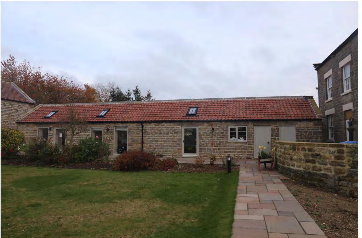
095_Gen_view - WF elev of E range