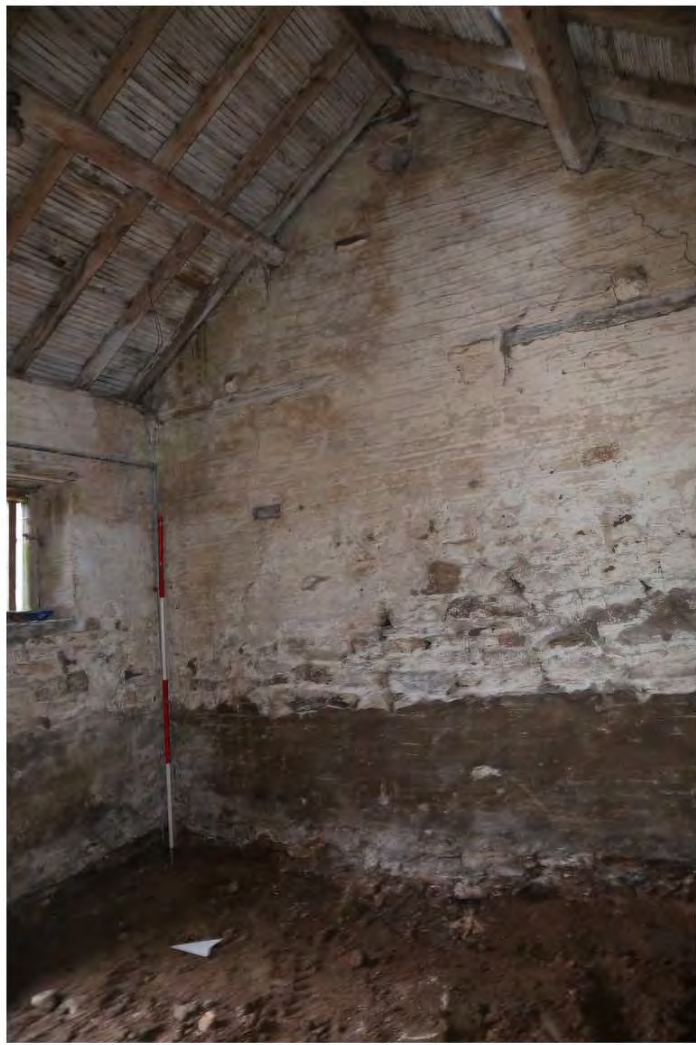
080_2000_2230_E_elev lk NE