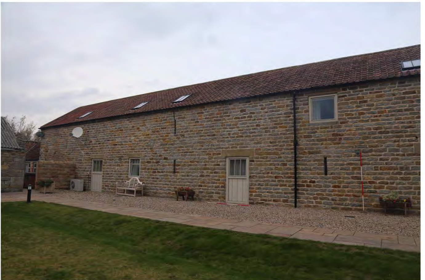
101_Gen_view - SF elev of N Range-W end Ik NW