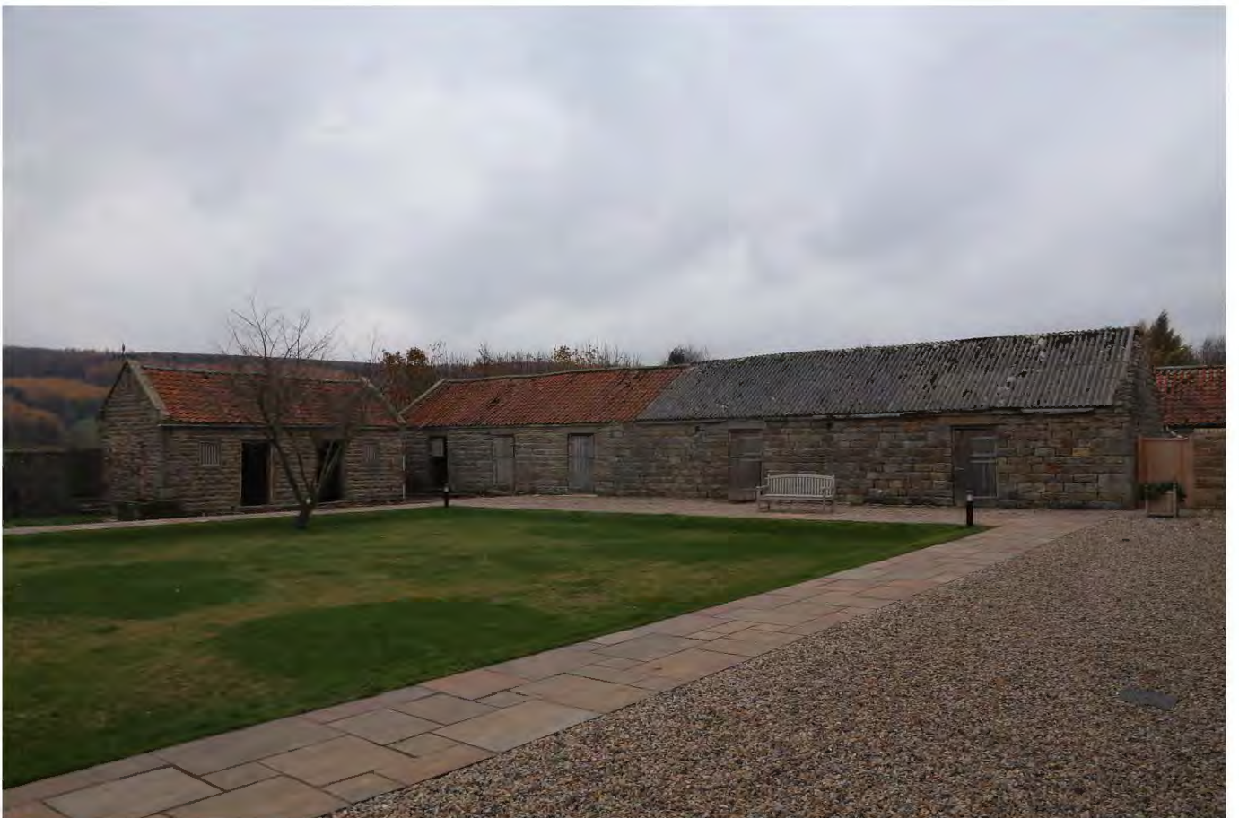
089_Gen_view of stable and byre lk SW