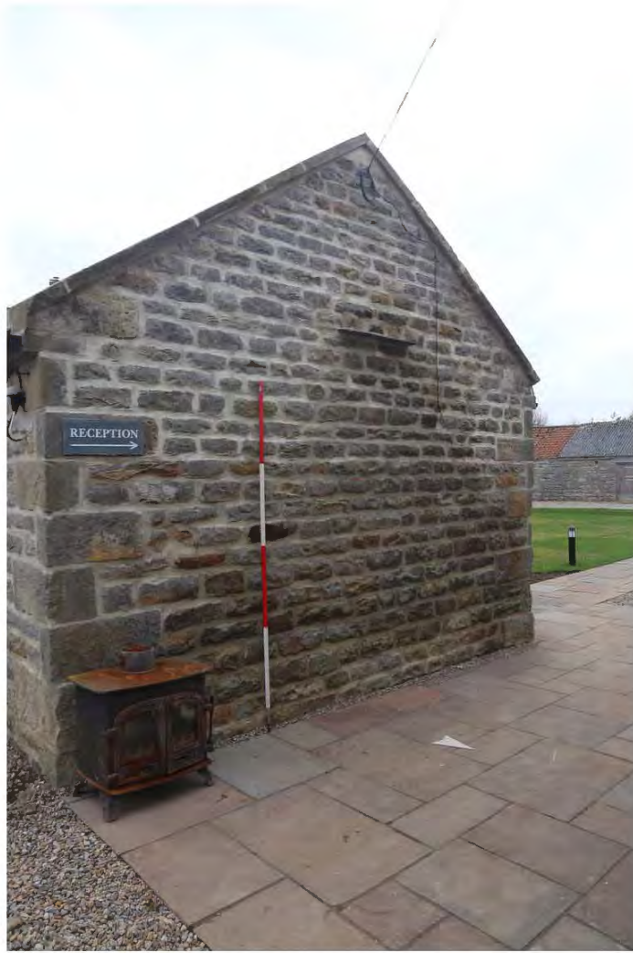
096_Gen_view - NF elev of E range