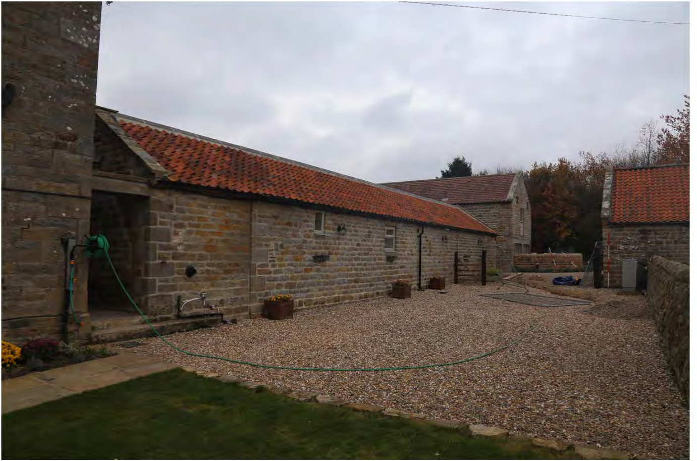
098_Gen_view - EF elev of E range