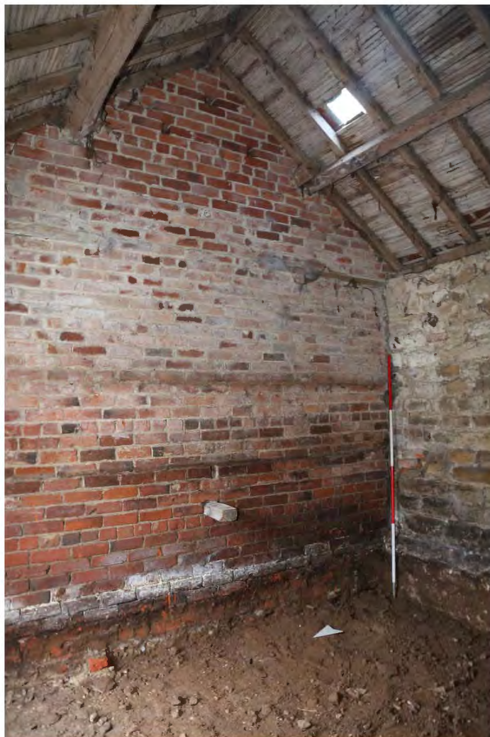
075_2000_2130-2103_E_elev lk SE