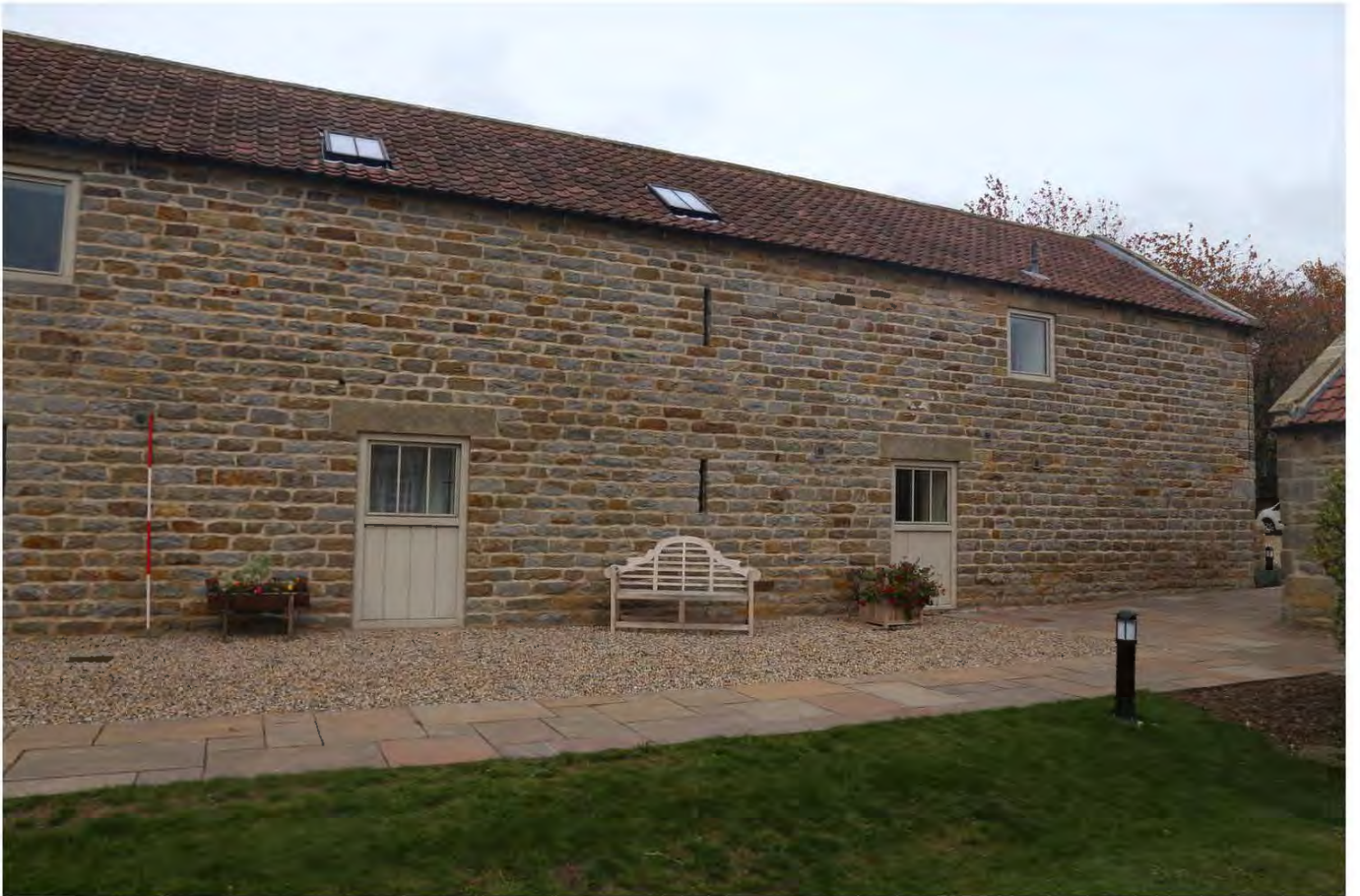
100_Gen_view - SF elev of N Range-E end Ik NE