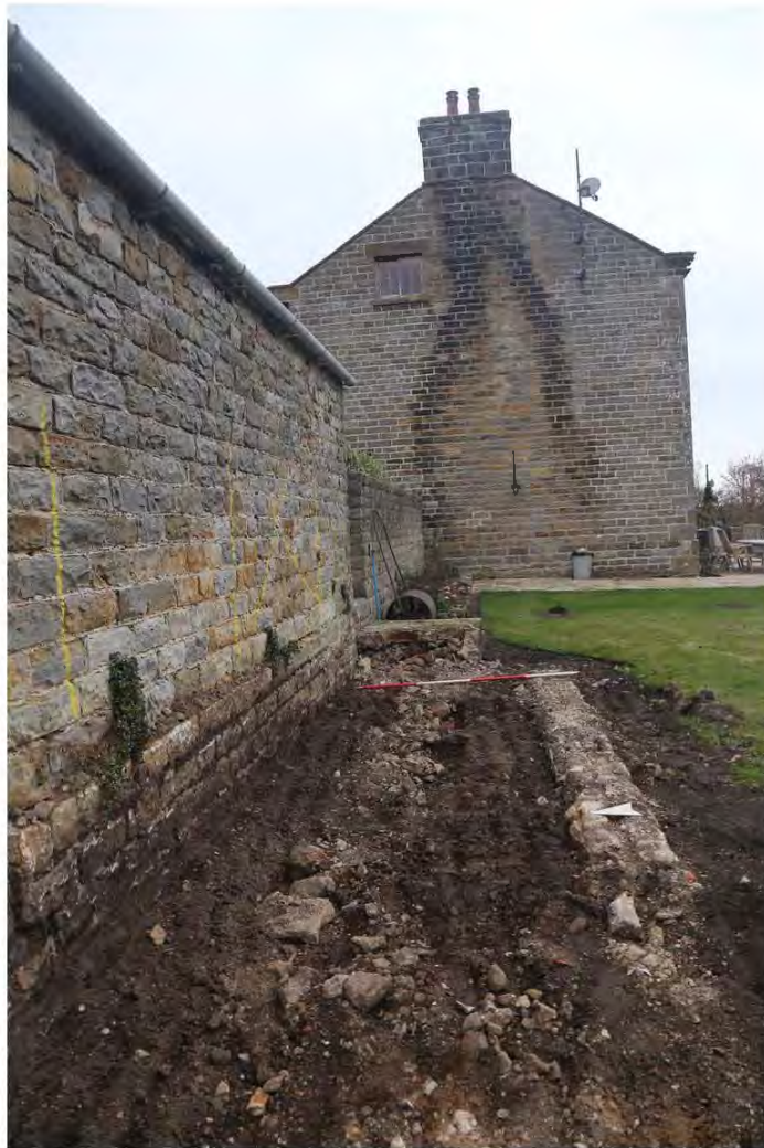
064_2000_2500_oblique outshot remains