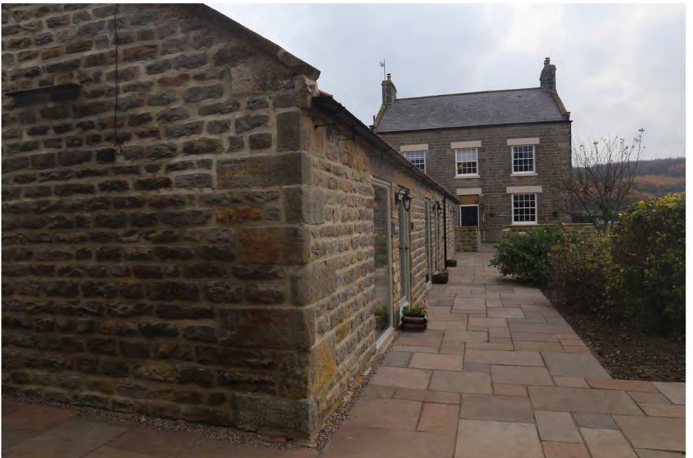
093_Gen_view - NF elev of house and E range