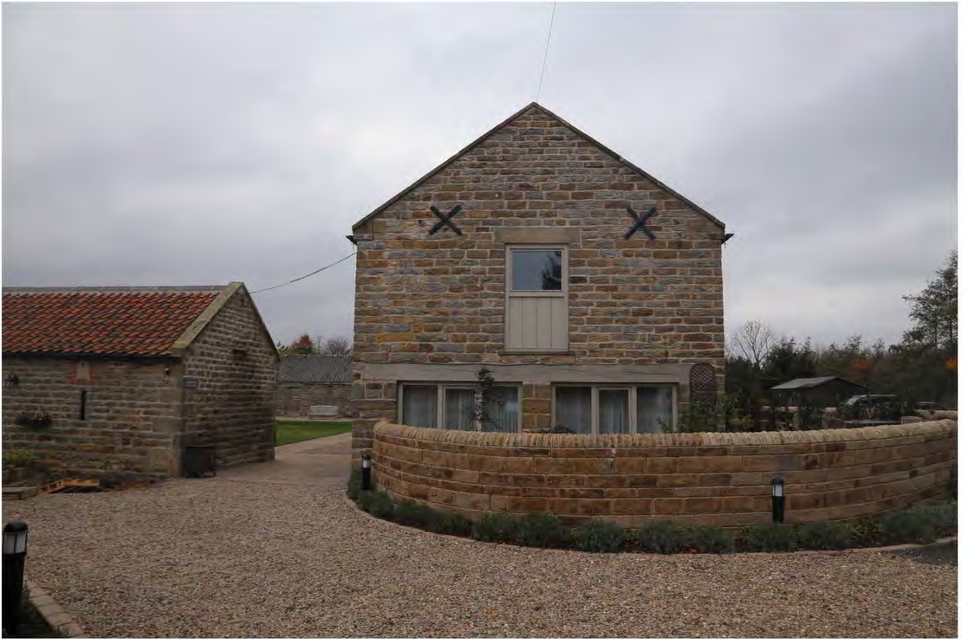
102_Gen_view - EF elev of N range