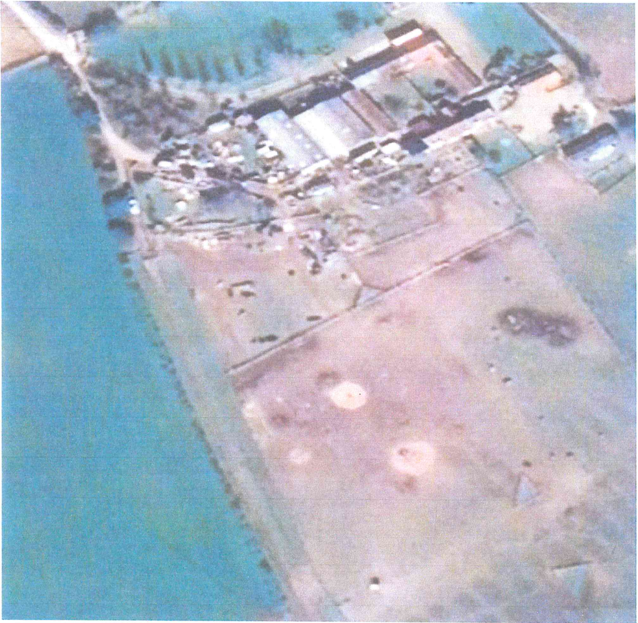
2019 – Application Site