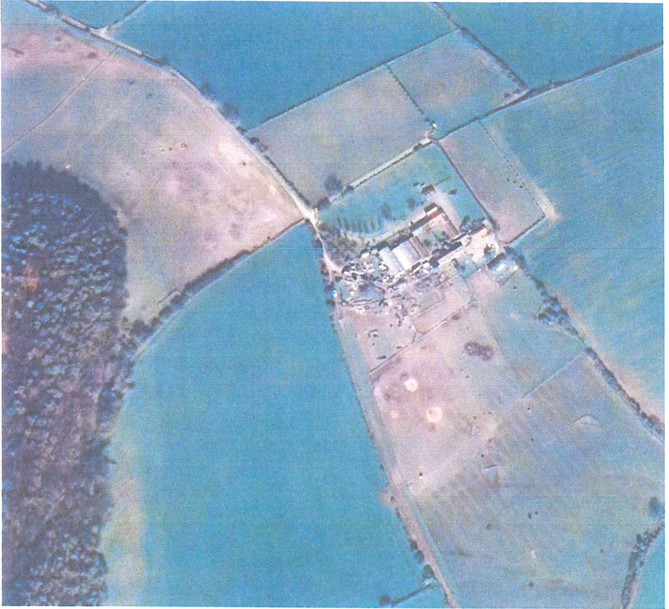
2019 – Application Site