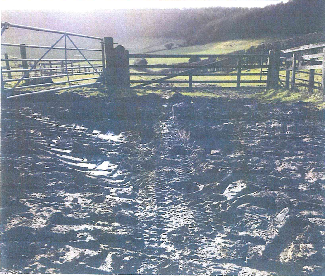
Beacon Brow Road 5 th Feb 2020