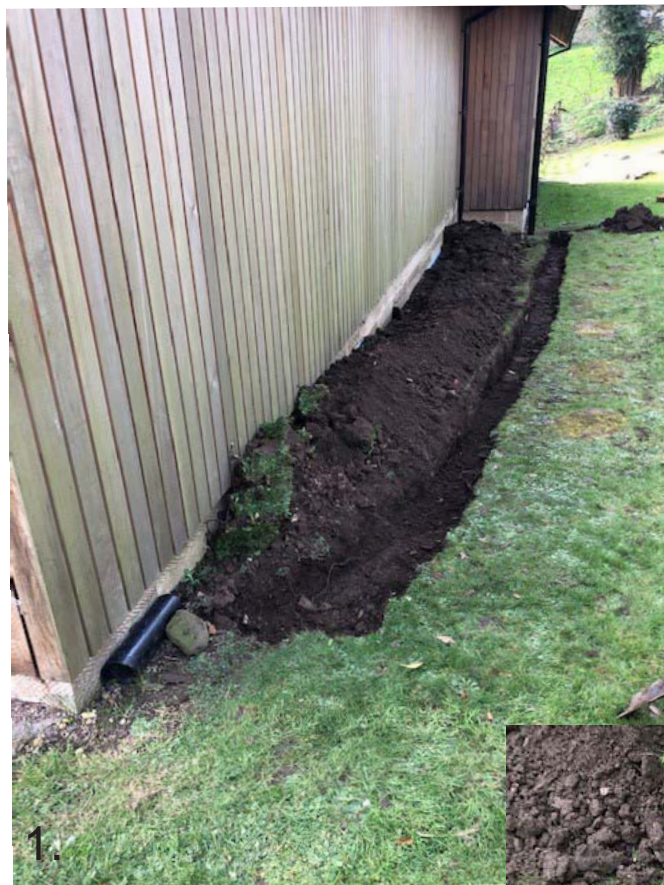
1. west elevation from north showing drainage link from cottage 1 shower to link to existing drainage