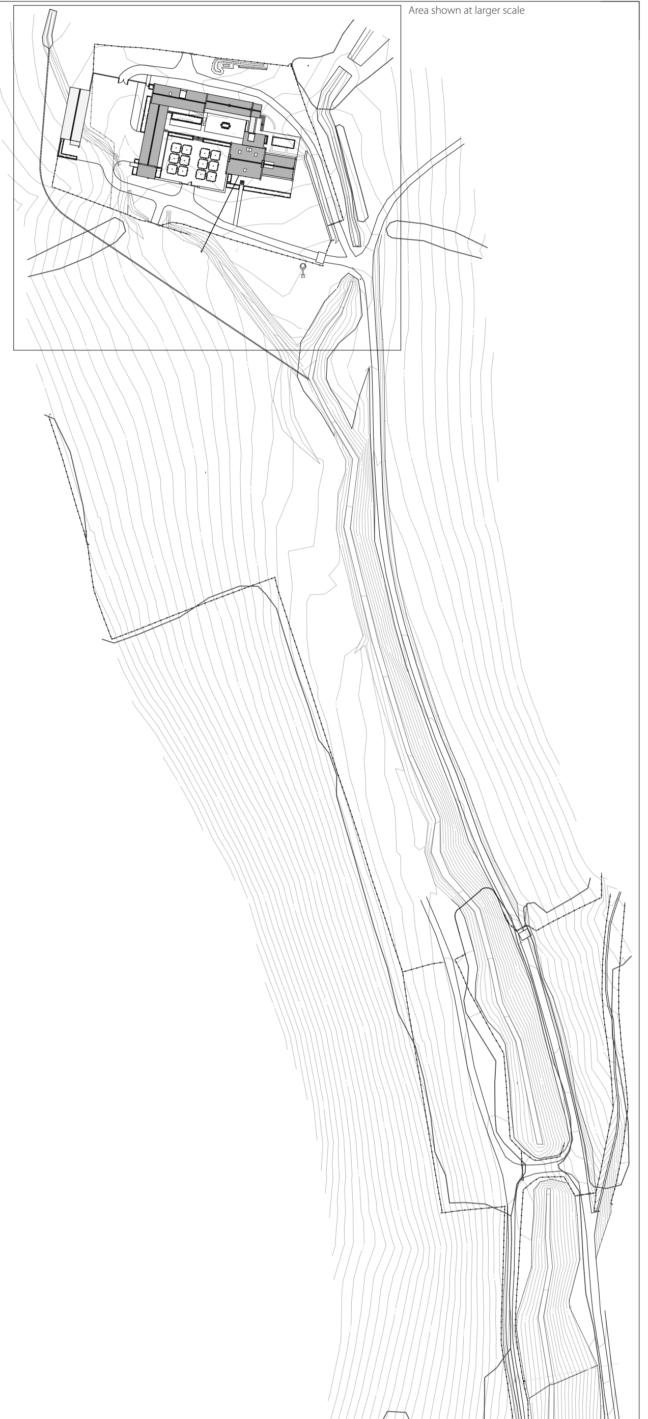
KEY PLAN (1:1250) (area shown at larger scale indicated by box)