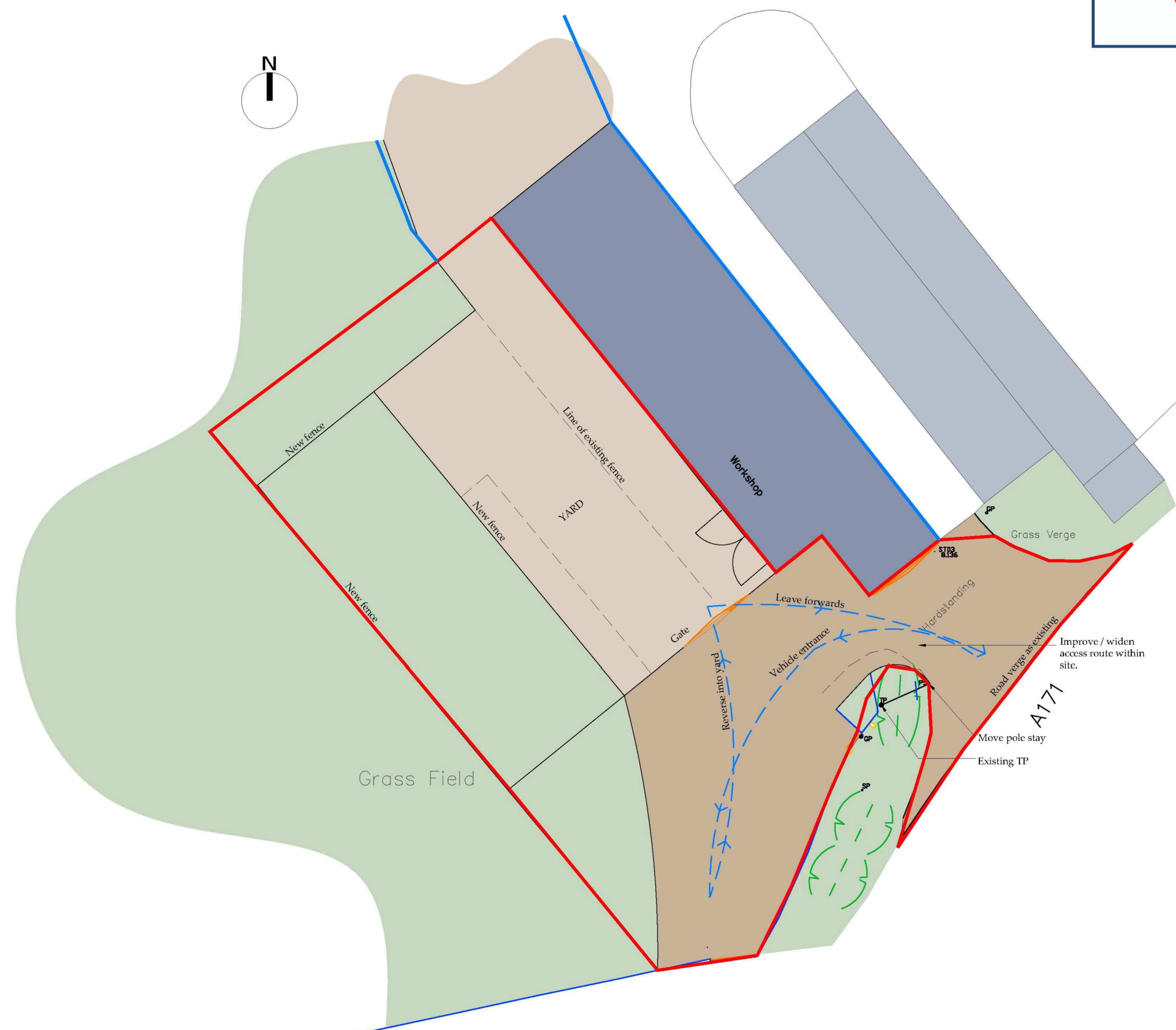
Proposed Block Plan Scale 1:200

Do not scale from this drawing, only figured dimensions are to be taken from this drawing. The contractor must verify all dimensions on site before commencing any work or shop drawings. The contractor must report any discrepancies before commencing work. If this drawing exceeds the quantities taken in any way, the technician is to be informed before work is initiated. Work within the construction (design and management) regulations 2015 is not to start until a health & safety plan has been produced. This drawing is copyright and must not be reproduced without consent of BHD Partnership Ltd. CDM Regulations Contractor must not start without 'Pre Construction Information' from Principle Designer. If unsure contact BHD. Contractor must agree the 'Principle Contractor' roll with the client prior to commencement of the works. Ensure if required under CDM2015 regulations that the project is notified to the HSE.