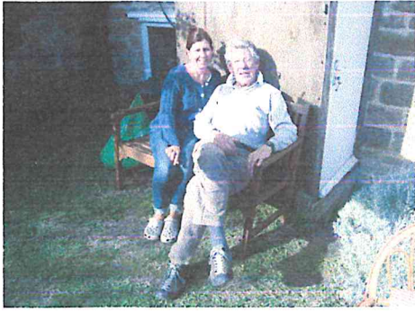
Previous shed at Woodside.