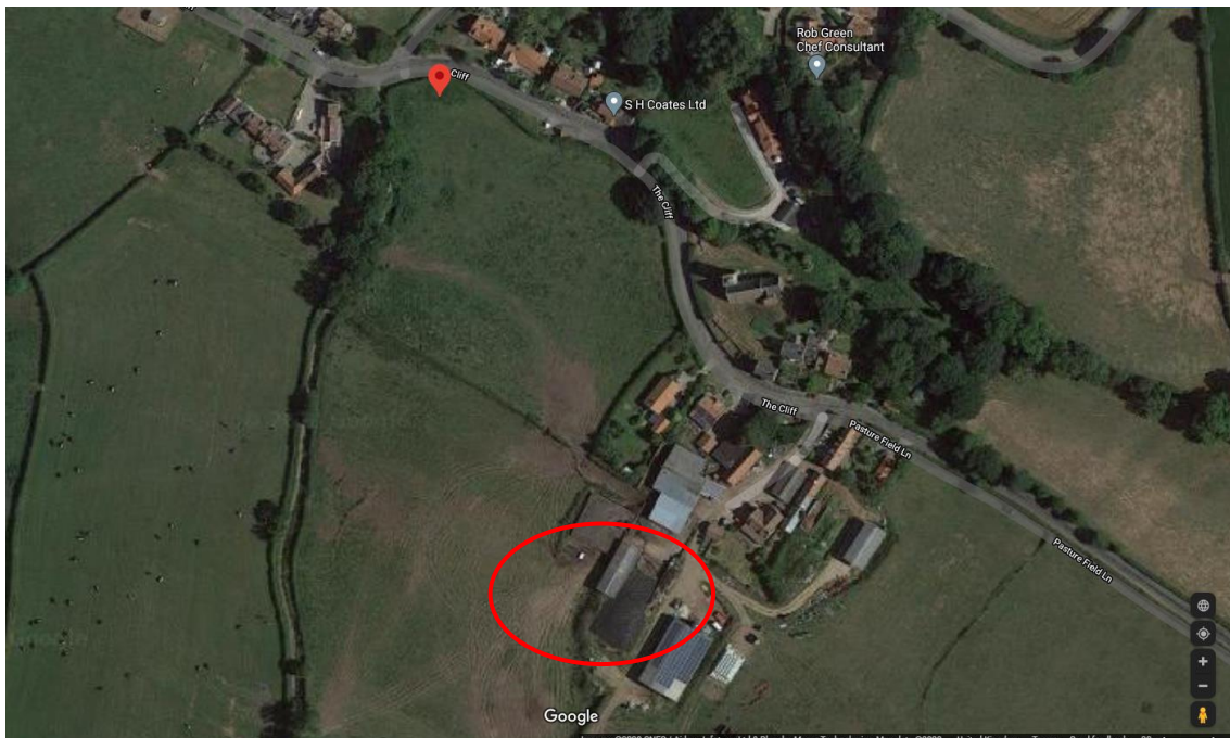
Fig 1. –High Farm, Ugglebarnby. Source: https://www.google.co.uk/maps/place/Ugglebarnby,+Whitby+YO22+5HX/@54.4518723,-0.6466881,317m/data=!3m1!1e3!4m5!3m4!1s0x487f1817a6c146e9:0x85ef8056fc00f084!8m2!3d54.452822!4d-0.646394 – for illustrative purposes only.