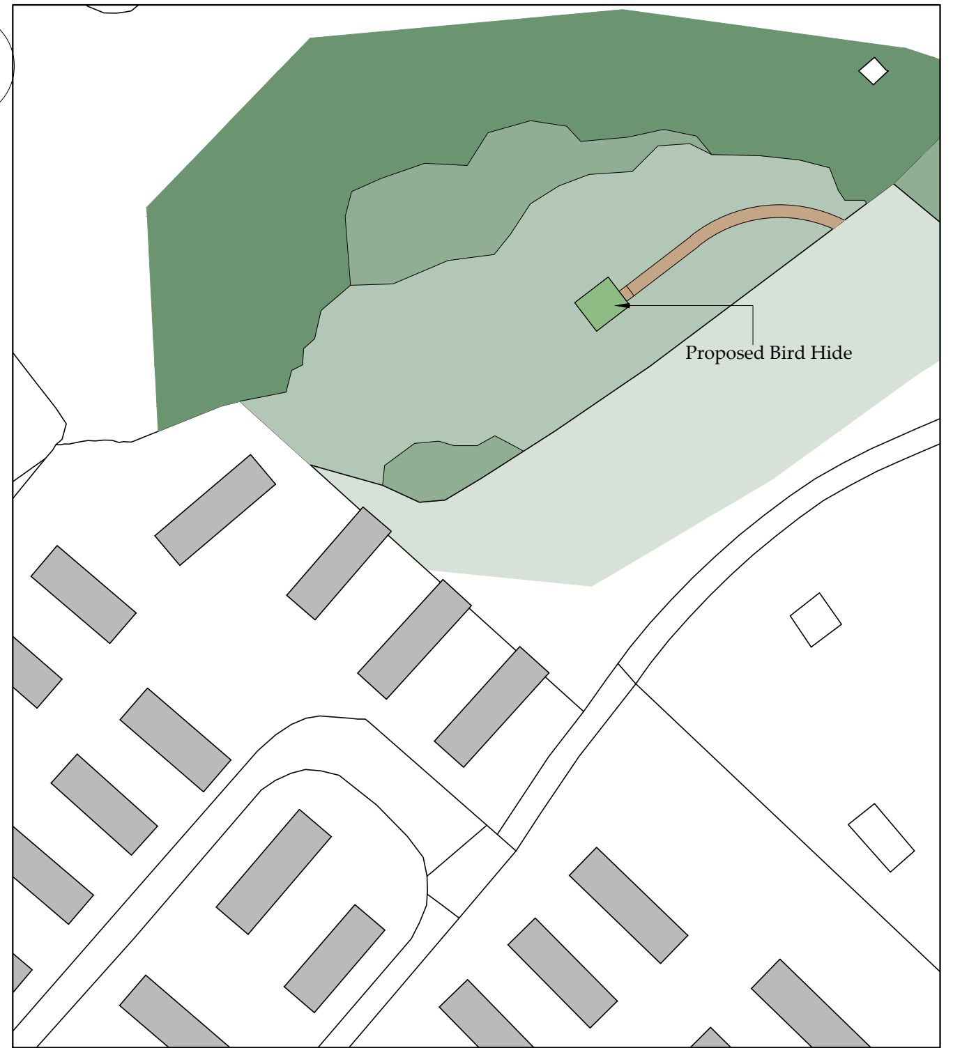
○ Block Plan Scale 1:500