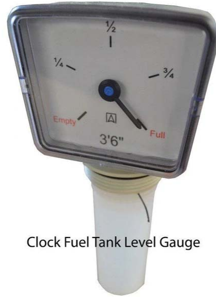
Clock Fuel Tank Level Gauge