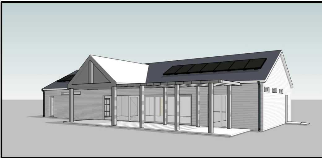
Fig 2: 3D Image of proposed front

The objective of the proposed works is to improve the appearance of the existing tired and dated reception building. The proposals aim to improve the quality of the existing building and bring it in-line with modern standards and efficiency. The proposed works internally aim to improve the functionality and relationship of the spaces.