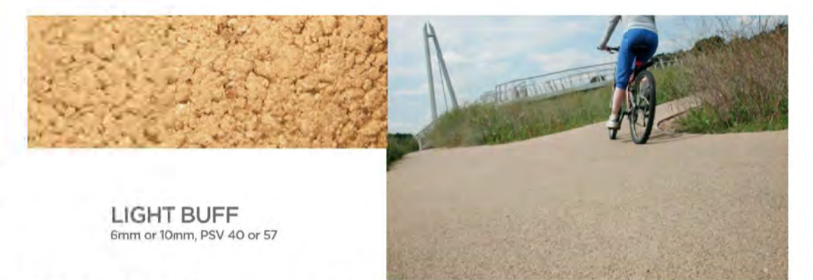
Proposed Porous Tarmac - Reference