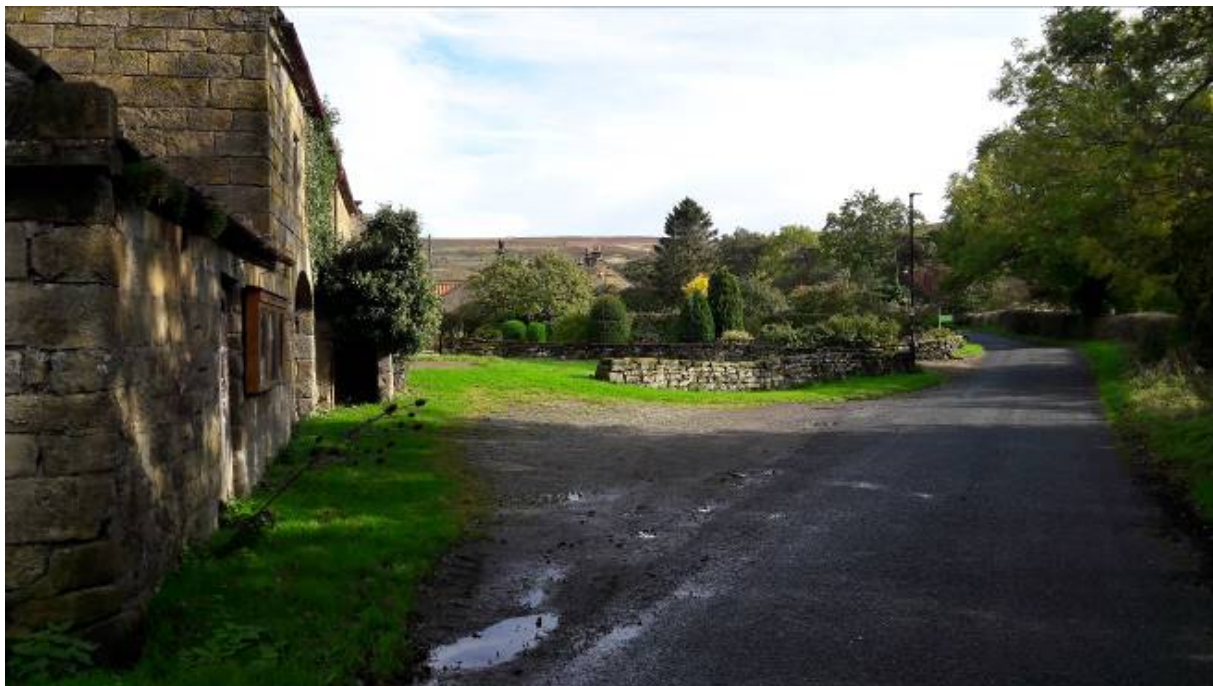
Photo showing front elevation of building to be converted as fronts onto road through Battersby