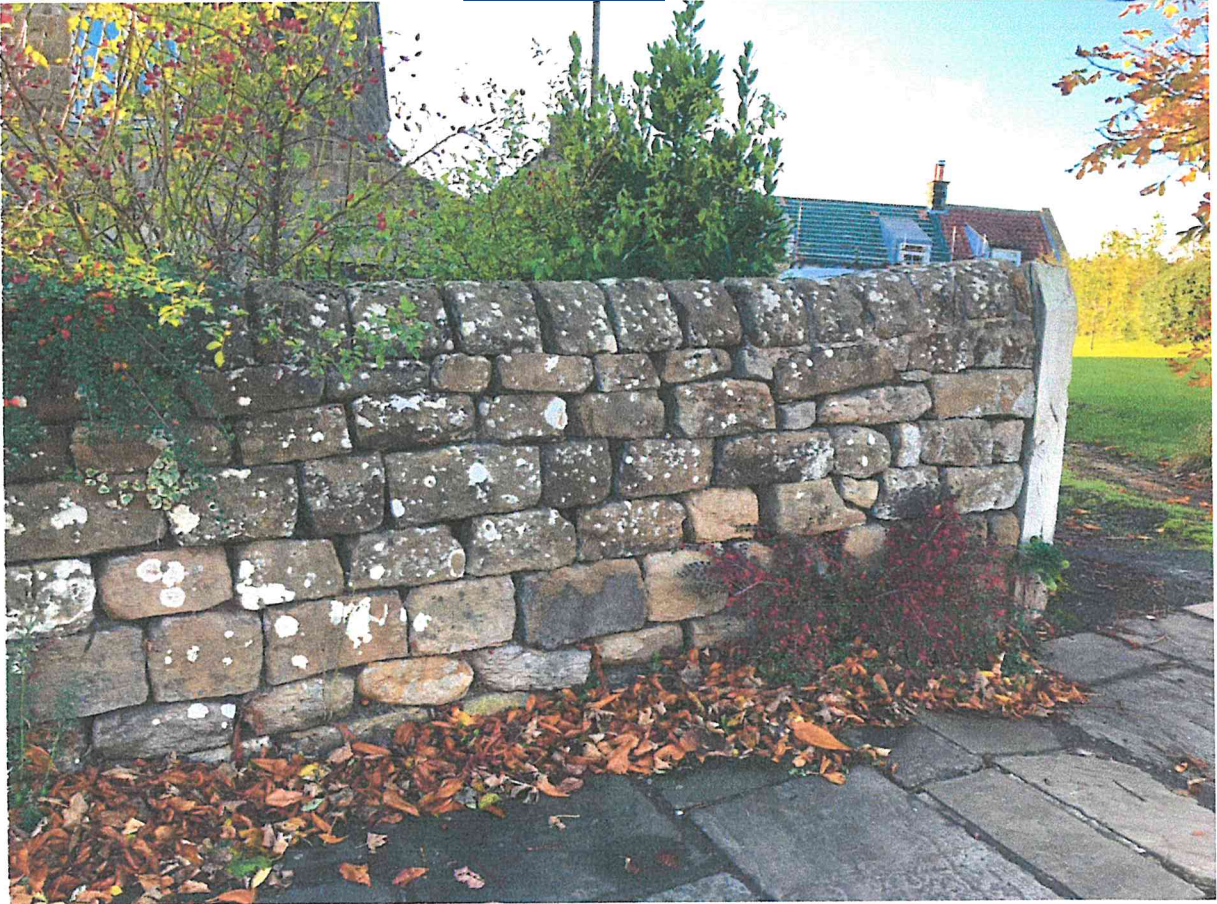
RIGHT-HAND NEIGHBOURING STONE WALL (PHOTO 3)