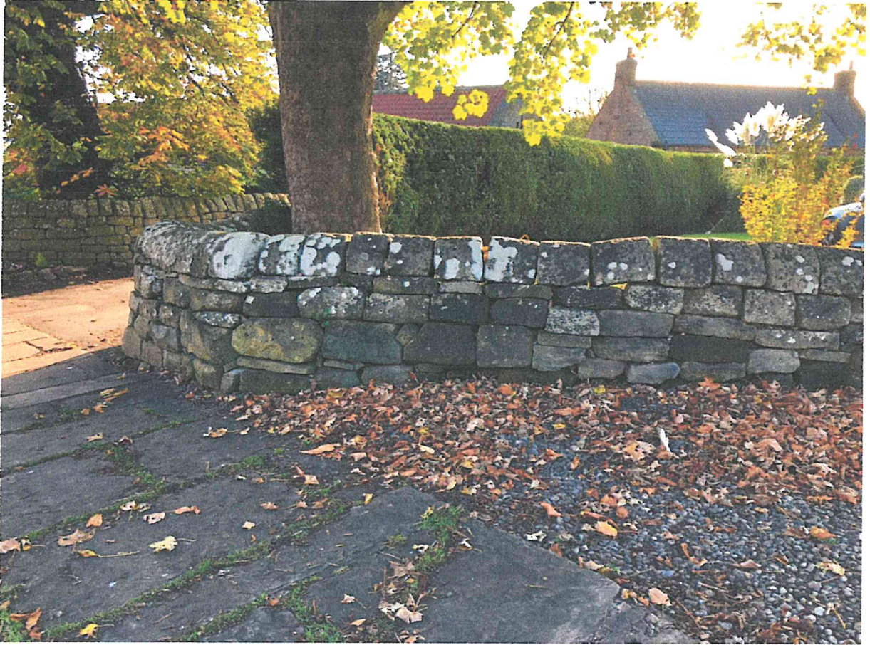
EXISTING STONE WALL (PHOTO 1)