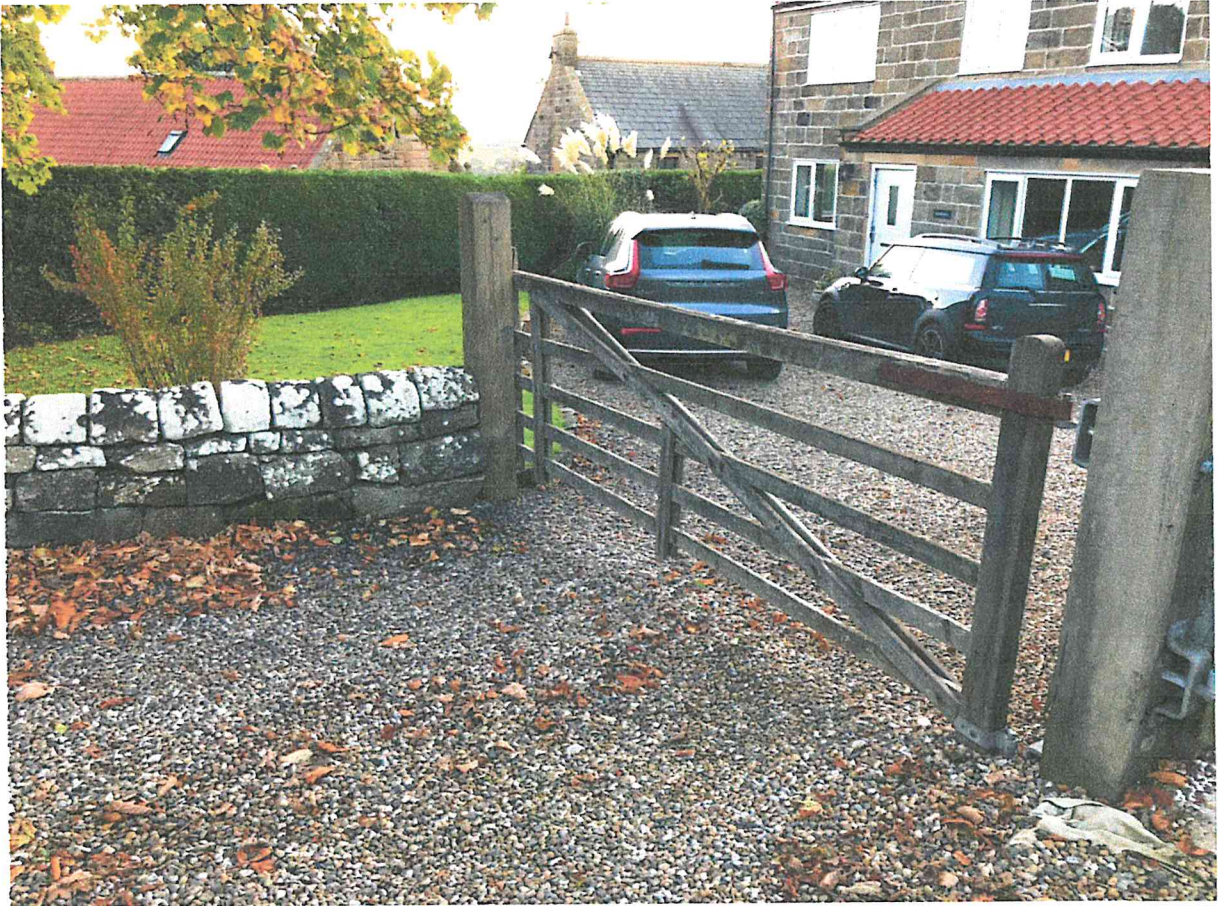
EXISTING STONE WALL AND WOODEN, FIVE BAR GATE (PHOTO 2)