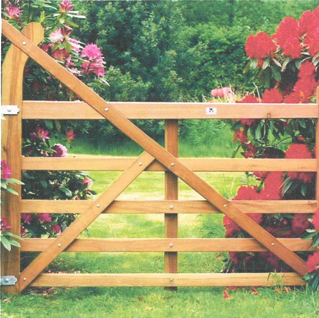
IMAGE OF BENT HEEL GATE, MADE BY DUNCOMBE SAWMILL, HELMSLEY (PHOTO 5)

PROPOSED NEW GATE, TO BE A SPLIT GATE, MADE UP OF A SHORTER GATE – 1.06M WIDE AND A LONGER GATE 2.13M WIDE