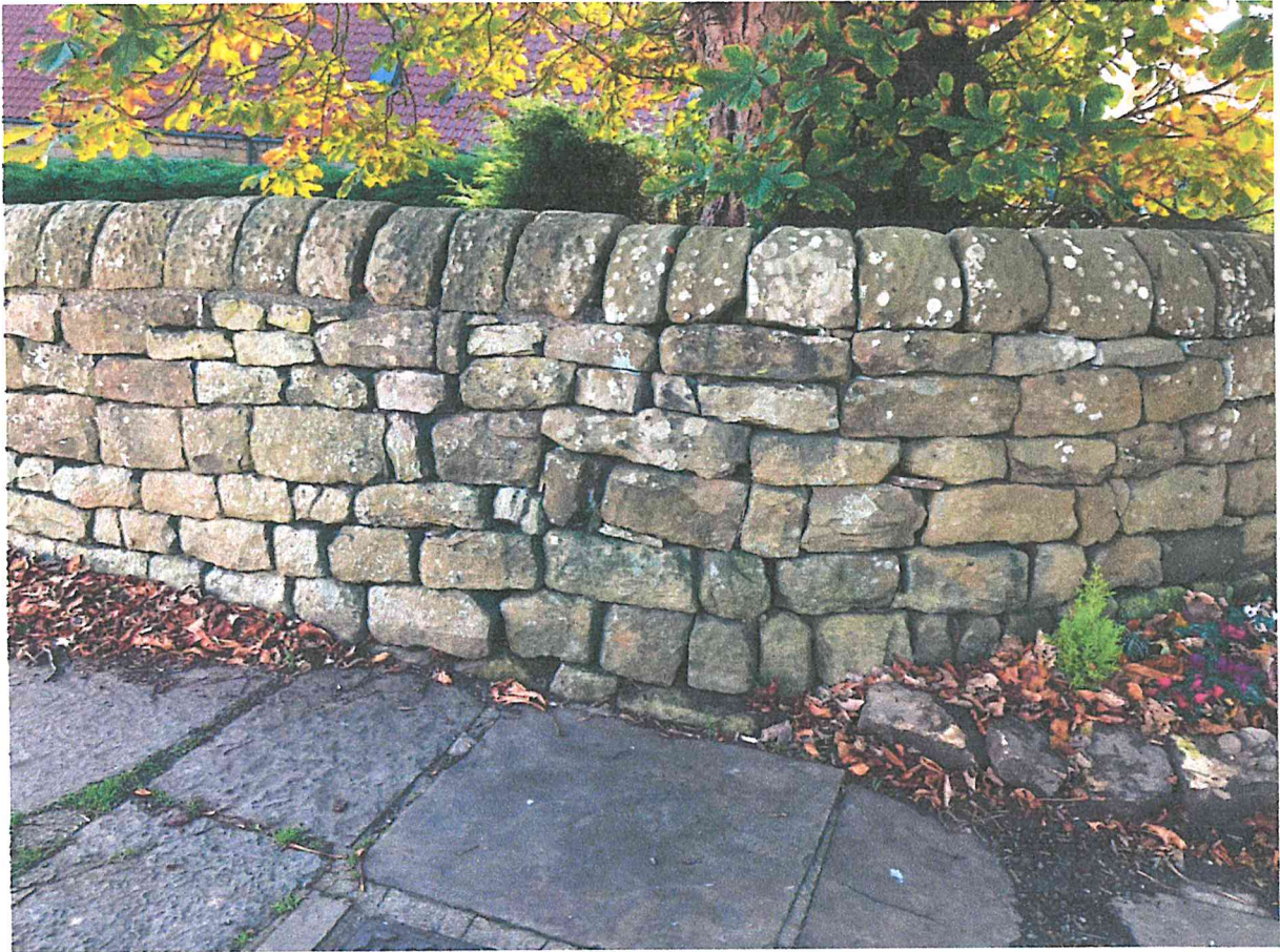
LEFT-HAND NEIGHBOURING WALL (PHOTO 4)