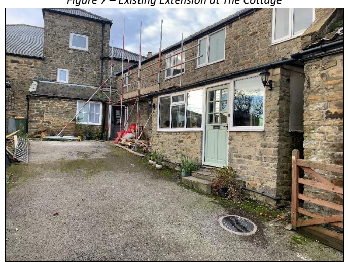
Figure 7 – Existing Extension at The Cottage

Furthermore, permission was granted to a previous owner of the cottage to create the existing extension to the ground floor which does not add anything to the special character of the adjacent listed building and a series of dormer extensions.