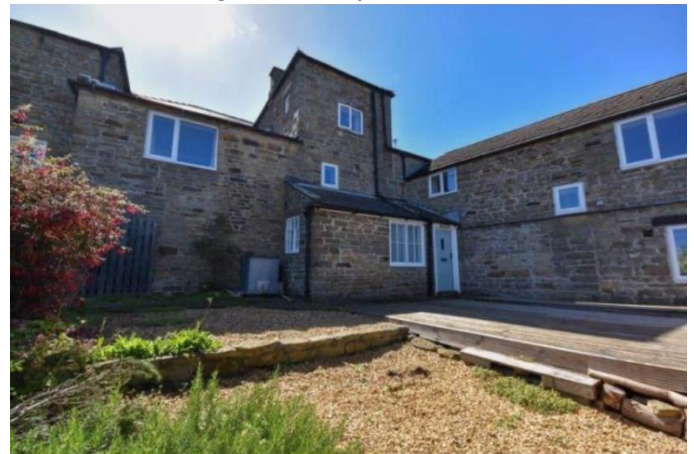
Figure 6 - Rear of Sneaton Hall

The rear elevation is contained within a small courtyard which forms part of the rear of the main dwelling that is Sneaton Hall. The access and driveway are both located to this side of the building. The main dwelling itself and the cottages have been much altered overtime and are not included within the details of the listing.