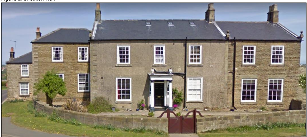
Figure 1: Sneaton Hall

The applicant has submitted plans to the NPA showing both the existing and proposed alterations to his property 'The Cottage' which forms one of two cottage dwellings attached to the north-western elevation of Sneaton Hall which is a Grade II Listed Building. It is not in a Conservation Area.