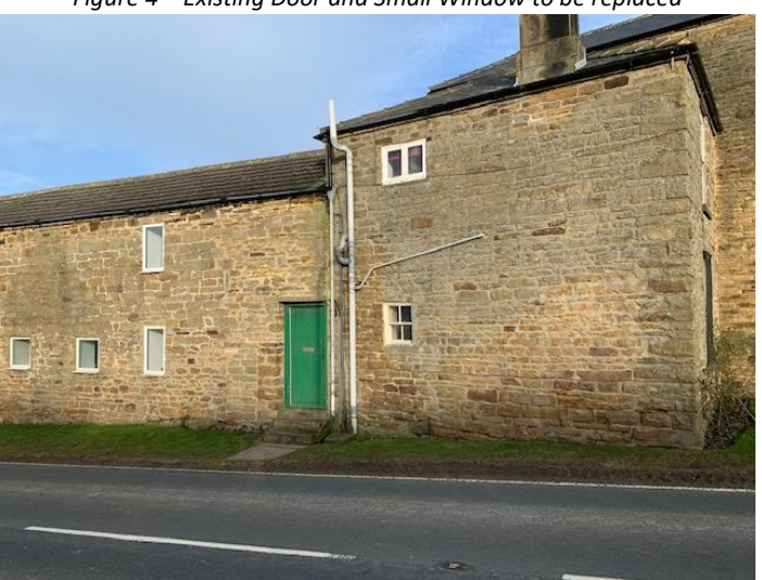
Figure 4 – Existing Door and Small Window to be replaced

It is clearly visible that the building itself has been subject to many alterations over the years through the presence of obvious changes to the stonework. An example of this is shown in figure 5 below, however, on site many examples can be seen on all elevations.