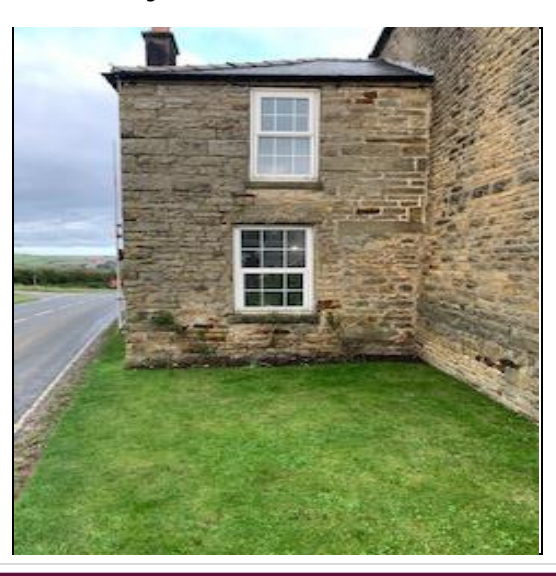
Figure 2 – End Elevation

With this in mind, as can be seen from the proposed elevational drawings submitted in support of the proposals (drawing no: AB/2021 - 3 of 5), the applicant does not propose any alteration to the 'end elevation' as seen on figure 1 in order to ensure the principal view of the listed building is preserved.