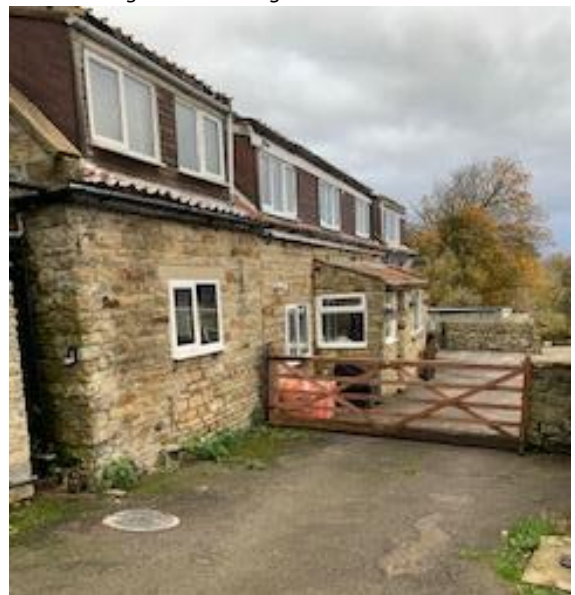
Figure 8 - Existing Dormer Extensions

Figure 7 above illustrates the existing extension which is proposed to be replaced with a larger extension which will allow the applicant to open up the internal living areas (kitchen and snug) and provide greater room and light opportunities alongside giving the building a contemporary feel. The applicant has further proposed the removal of 2 existing first floor windows and replacement with doors and a small balcony area above the proposed first floor extension (as seen on drawing no: AB/2021 - 3 of 5 and 5 of 5).