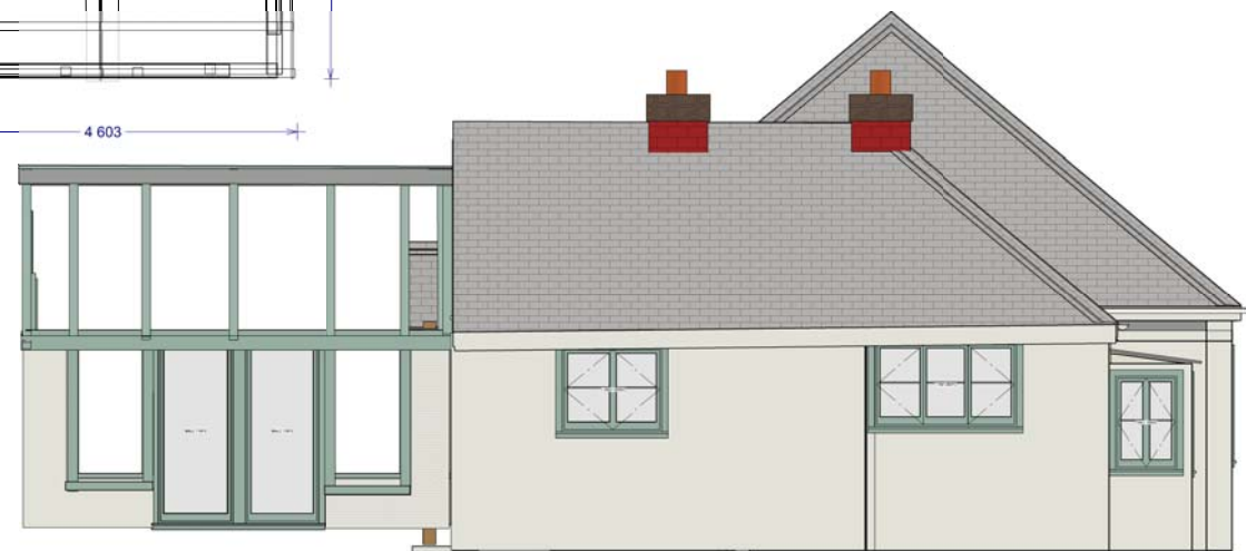
RIGHT HAND ELEVATION