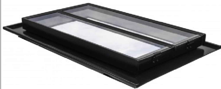
THE ROOFLIGHT COMPANY CONSERVATION ROOFLIGHT CR10-2