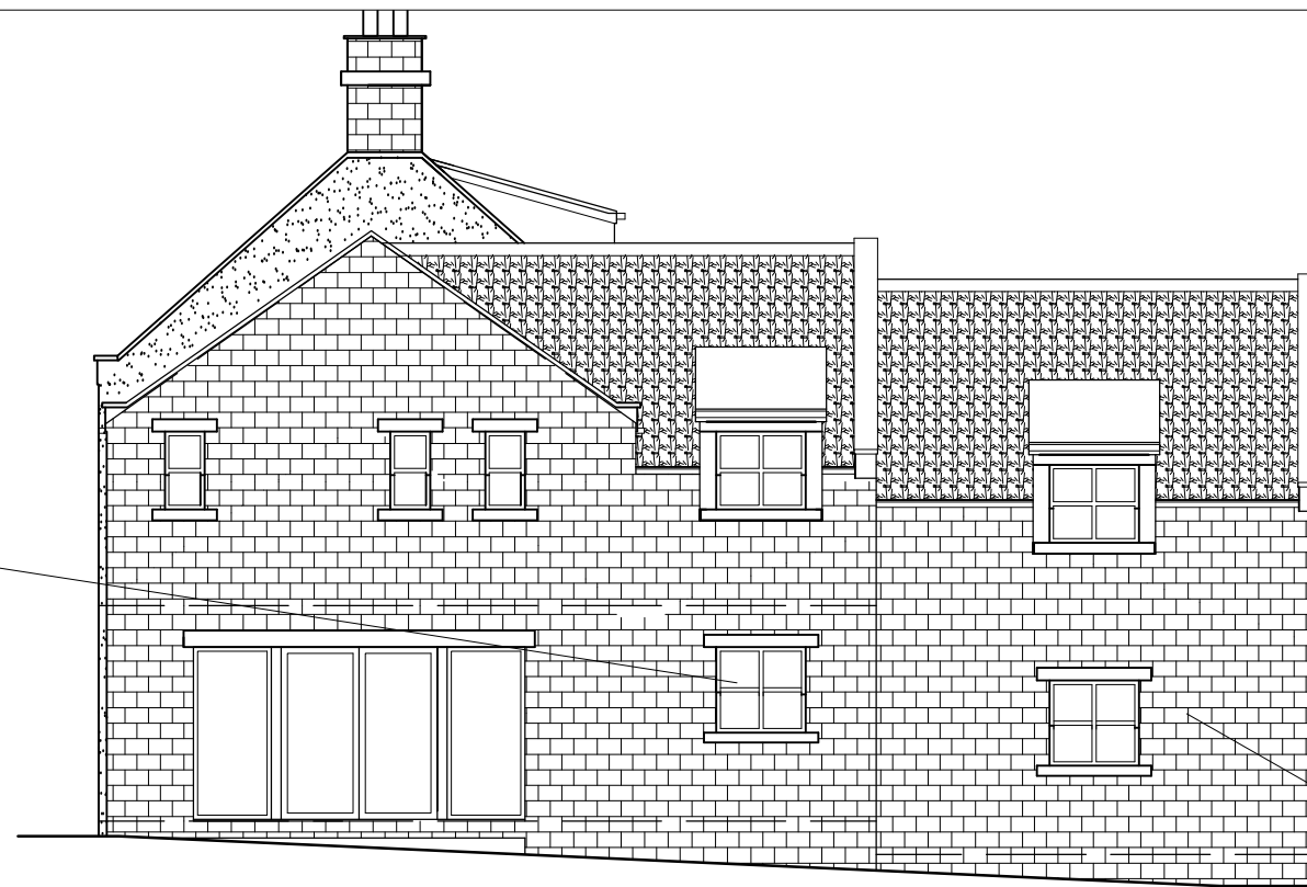
Car Park Elevation