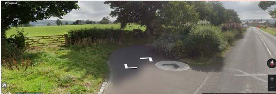
Same photo as used in Committee Report – Looking south towards the village centre