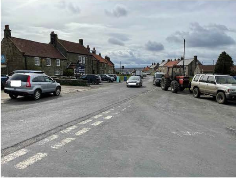
Vehicle parking at road junction opposite the garage.