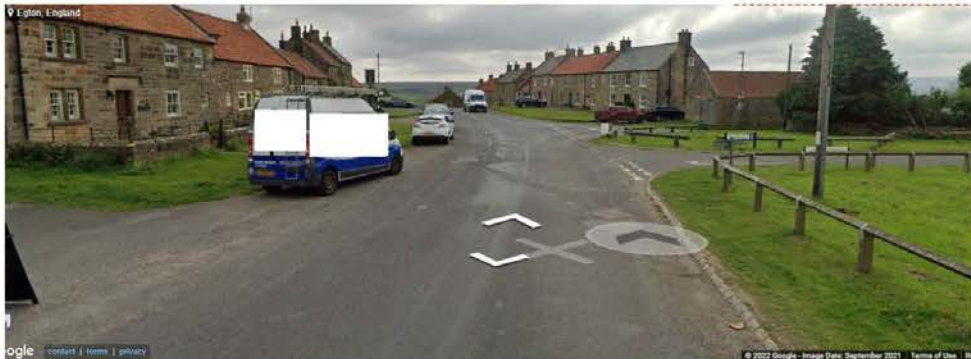
Looking south along High Street – note parking to front of properties