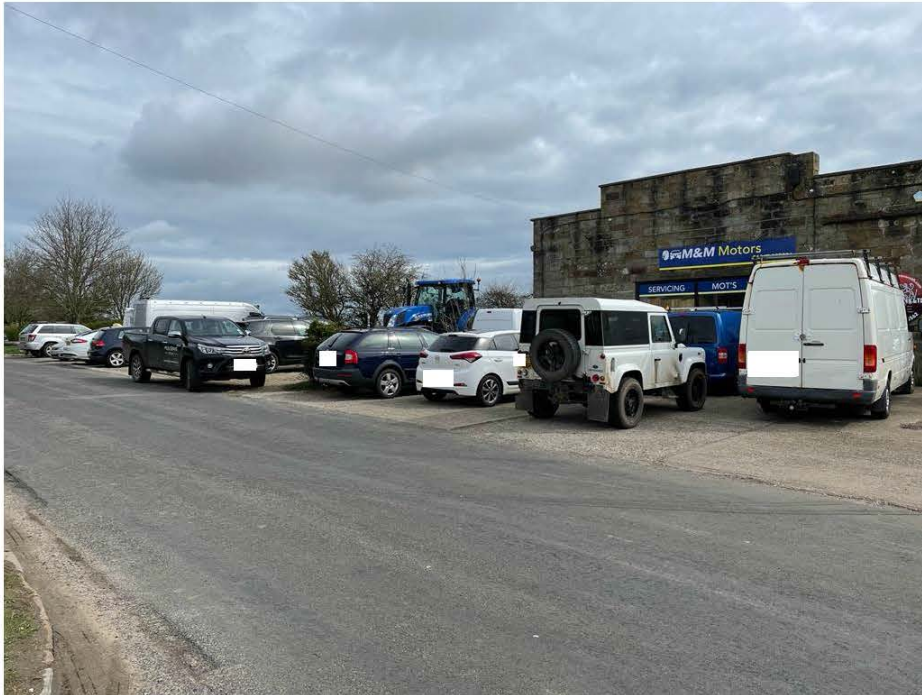
Vehicle parking close to application site entrance