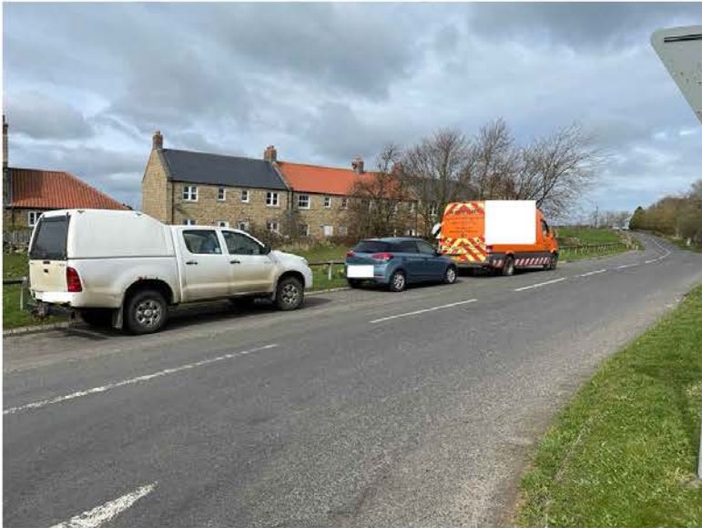
On street vehicle parking in the High Street