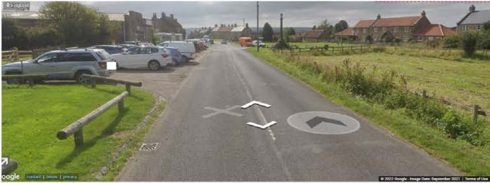
Looking south towards village centre