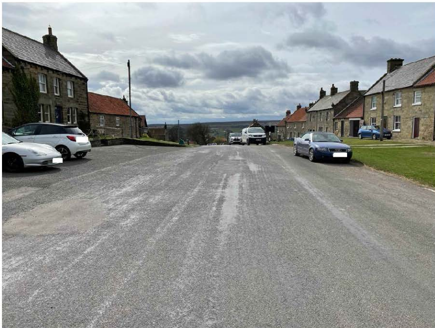
Vehicle parking in High Street – including on street and on grass verge