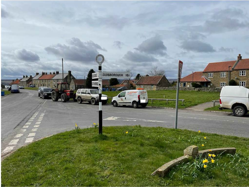
Vehicles parked on street at junction