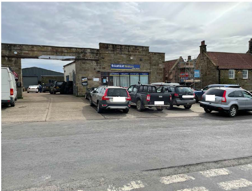
Vehicle parking at the garage, note industrial unit to the rear.