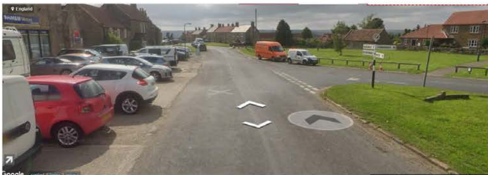
Outside the garage