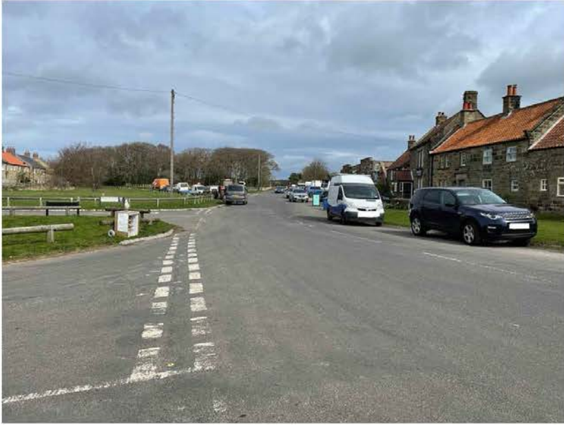
Vehicles parked on street in High Street