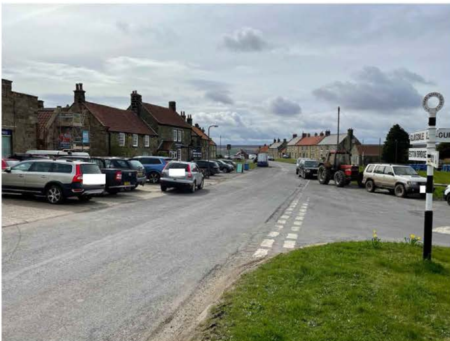
Vehicle parking at the junction near the garage looking south