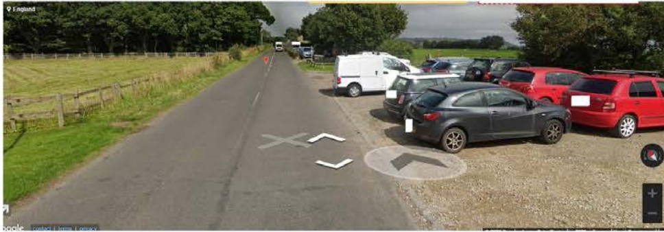
From High Street looking north