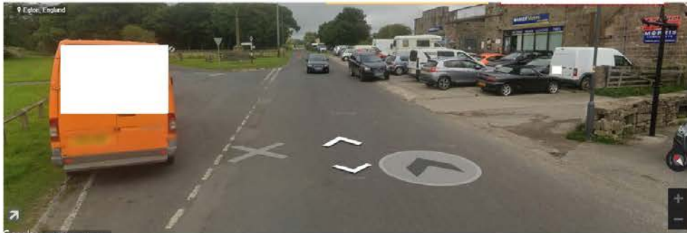
From High Street looking north towards the site with garage in the foreground (orange van is parked)