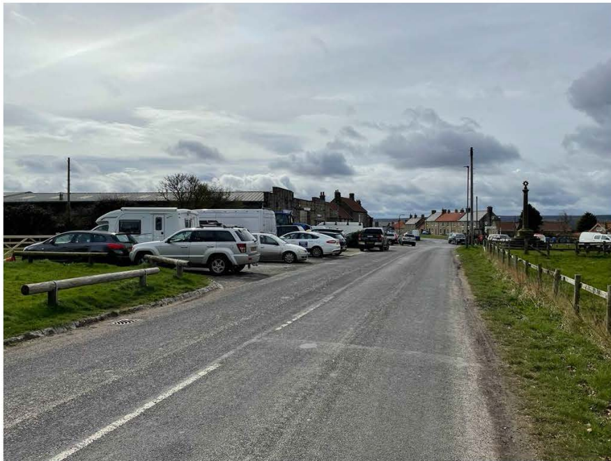
Vehicle parking close to application site entrance, looking south