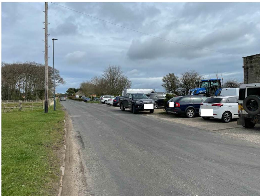
Vehicle parking close to garage, looking north