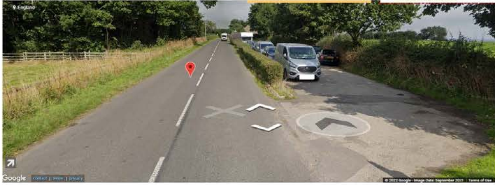
Layby parking (note two lines of cars) – looking north