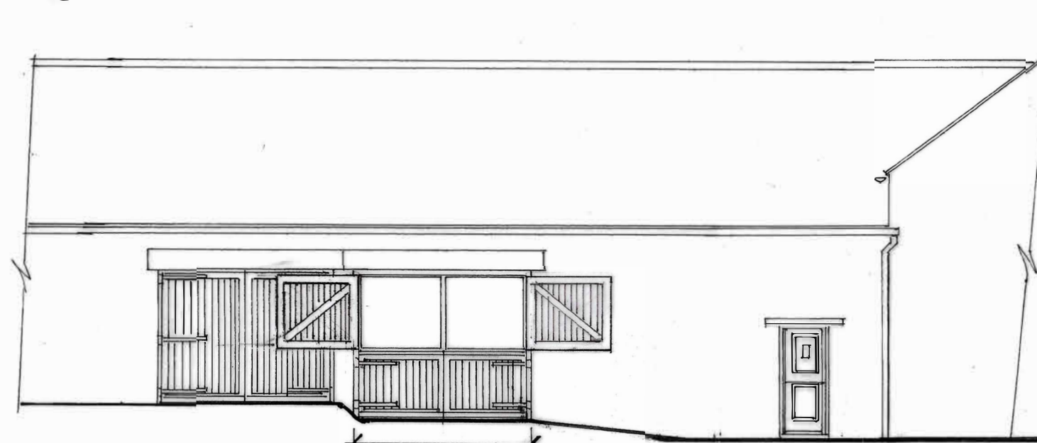
SIDE ELEVATION (Showing doors open)

Glazing set back as far as practically possible