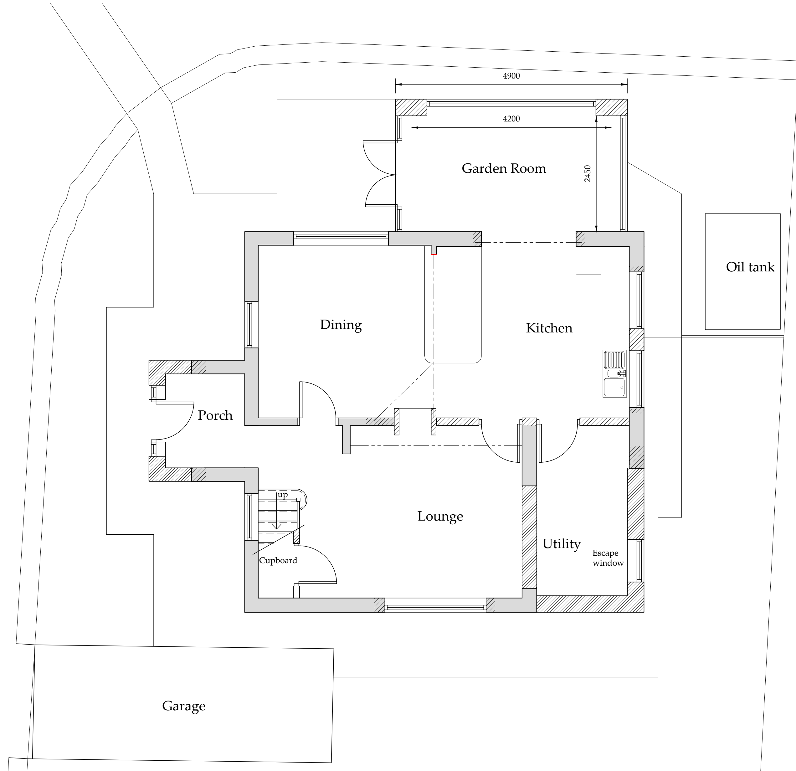
Ground Floor Plan Scale 1:50