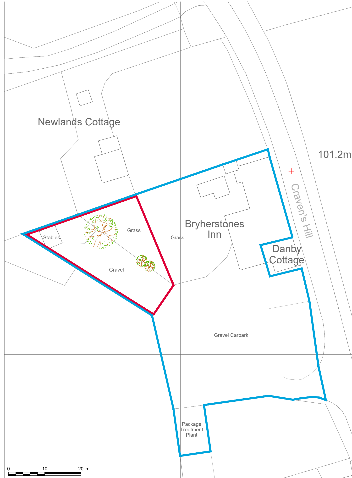
EXISTING BLOCK PLAN 1:500