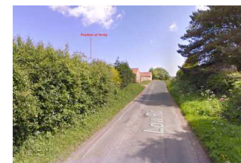
South west view