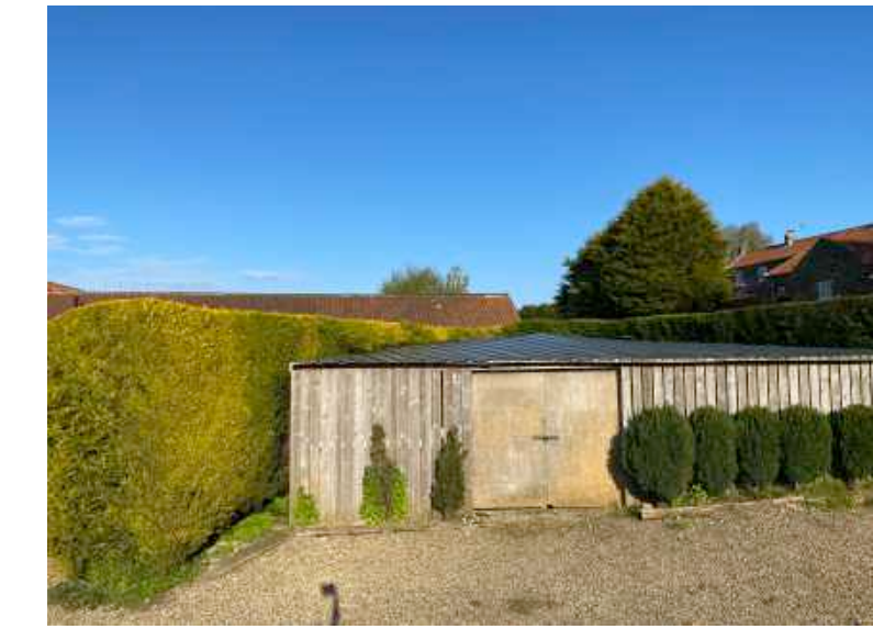
West elevation detail