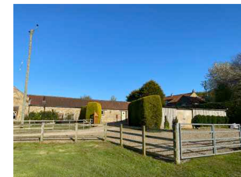
View from north west