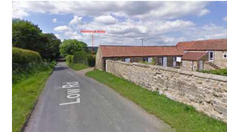
South east view