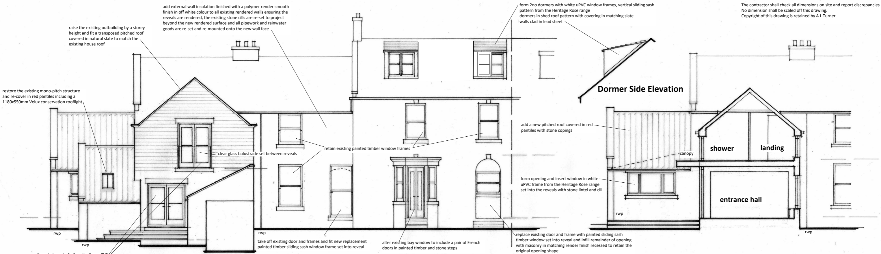
South-East Elevation with Extended Outbuildings in Foreground