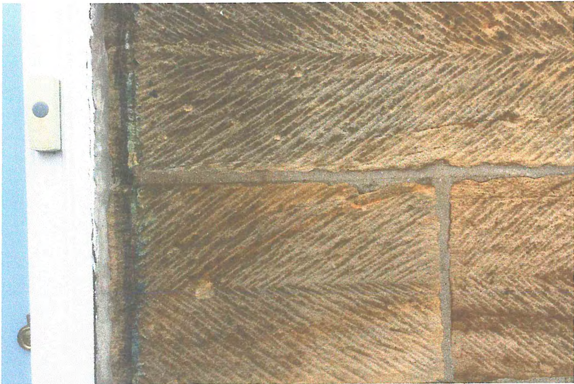
Existing dressed stone of cottage