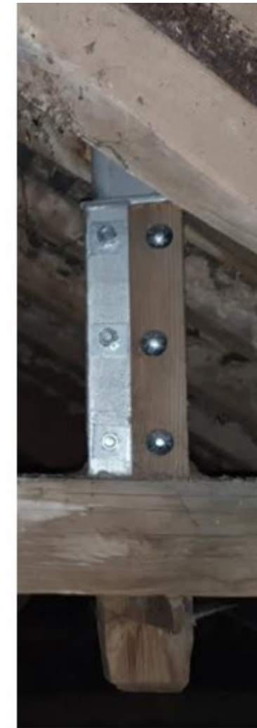
Approved Drawing showing steel angle and photo showing typical installation