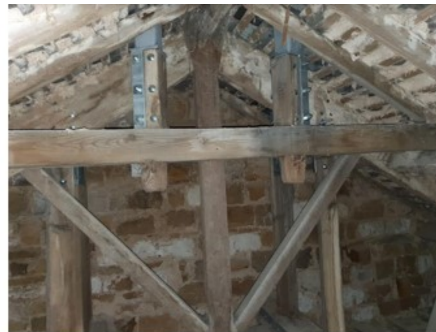
Current situation showing historic timbers and new steel angle