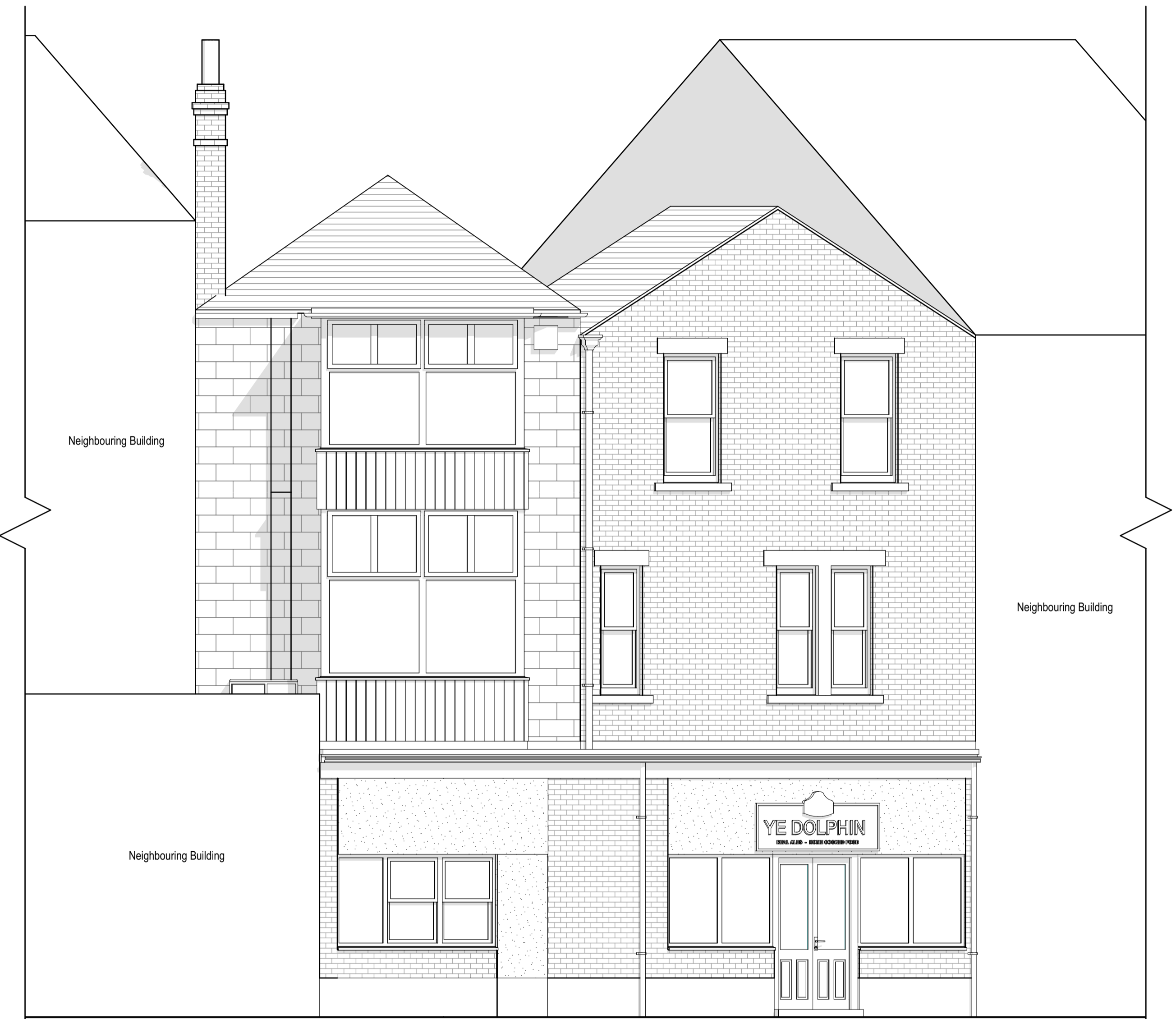
Existing Elevation (Parallel to Bay Windows) 1:50