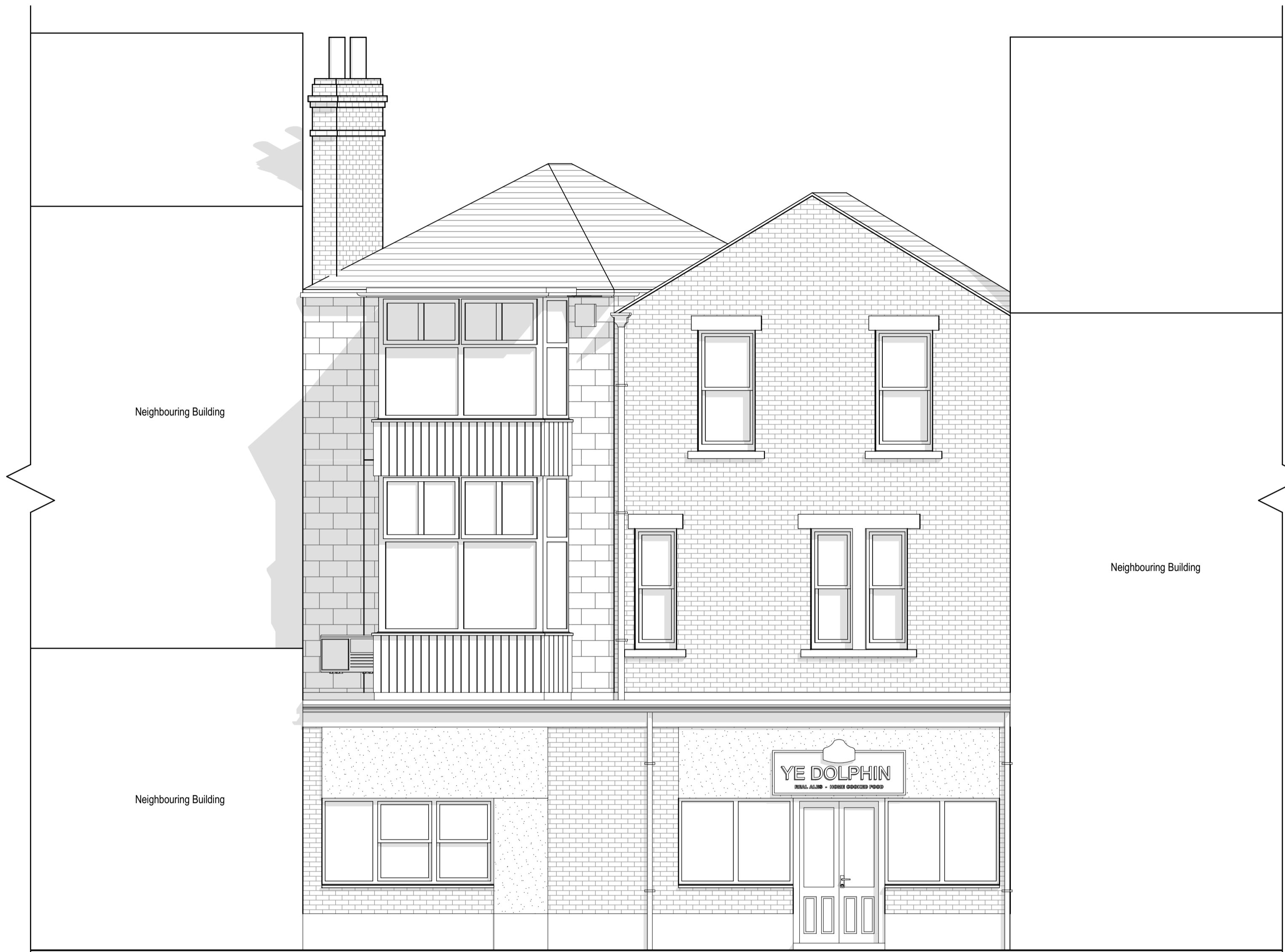
Existing Elevation (Parallel to Lower Shop Front) 1:50