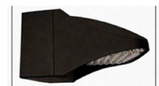
LUMINAIRE TYPE 5A