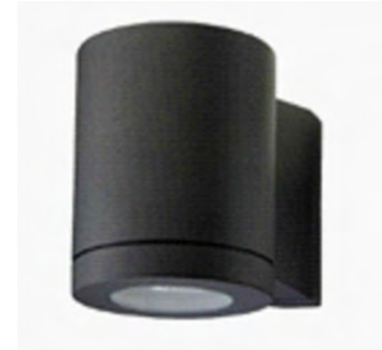
LUMINAIRE TYPE 3S