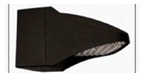
LUMINAIRE TYPE 5A