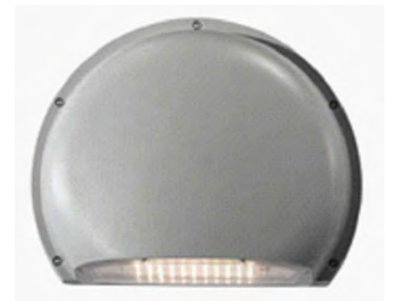
LUMINAIRE TYPE 1U

Emergency unit-incorporated within new unit