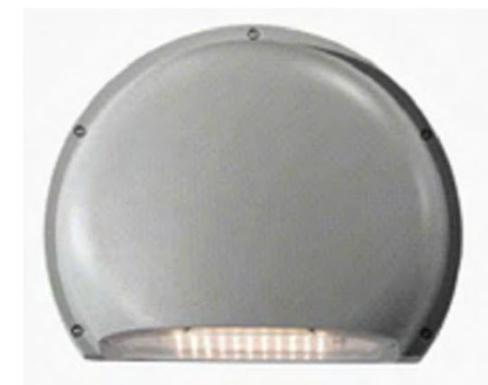
LUMINAIRE TYPE 1U

EM: Emergency unit-incorporated within new unit