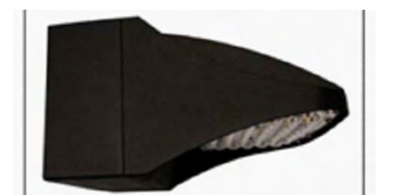
LUMINAIRE TYPE 5A