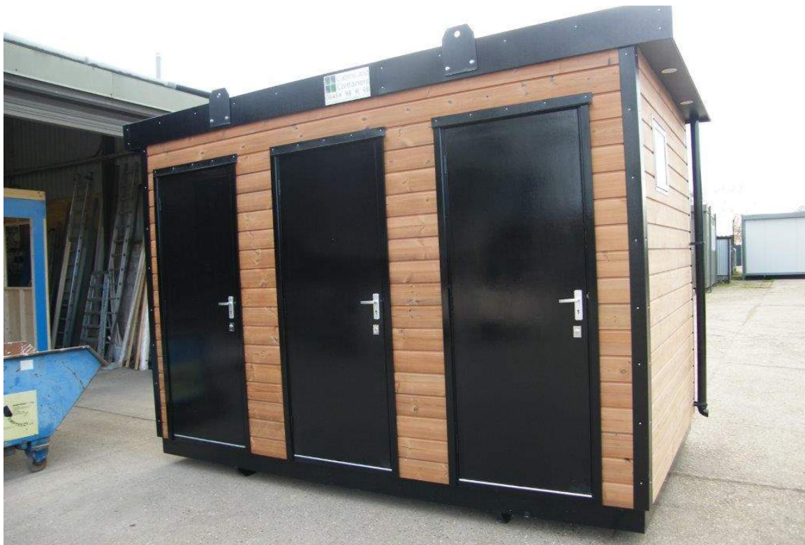
Figure 1 - Proposed mobile toilet and shower block

A photograph of the proposed toilet and shower block can be seen below. The applicant is proposing to site a purpose built, clad shipping container, which are converted to form toilet and shower facilities. The container will offer 2No. toilets and 1No. small shower room.