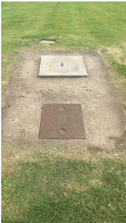
Fig 1. – Existing system to be used.

2nd photos is under stone top start of the drain field