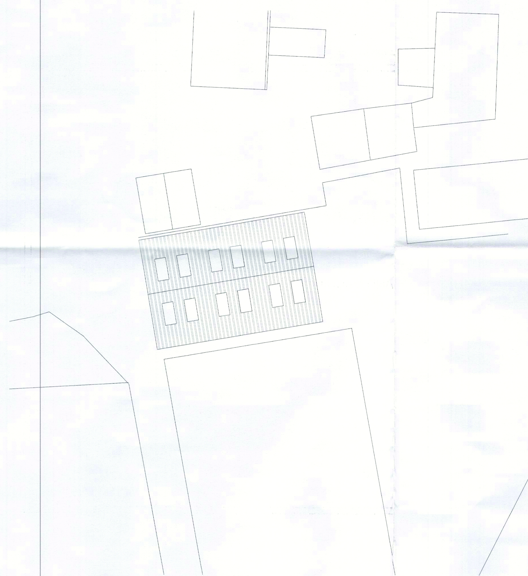
PROPOSED BLOCK PLAN SCALE 1 : 200