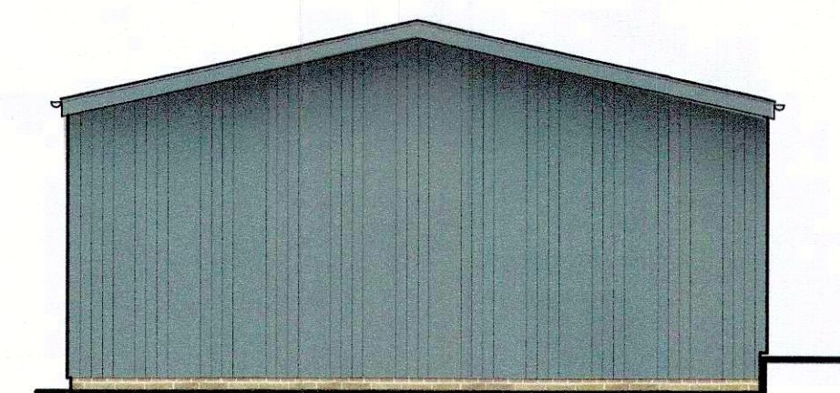
PROPOSED REAR ELEVATION SCALE 1 : 100