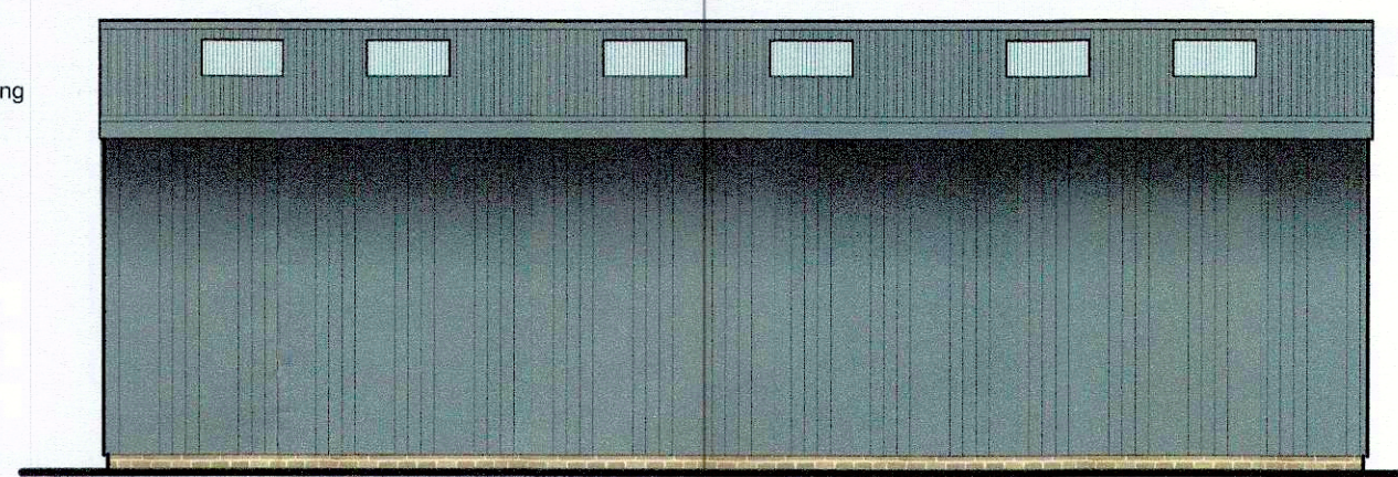
PROPOSED SOUTH ELEVATION SCALE 1 : 100