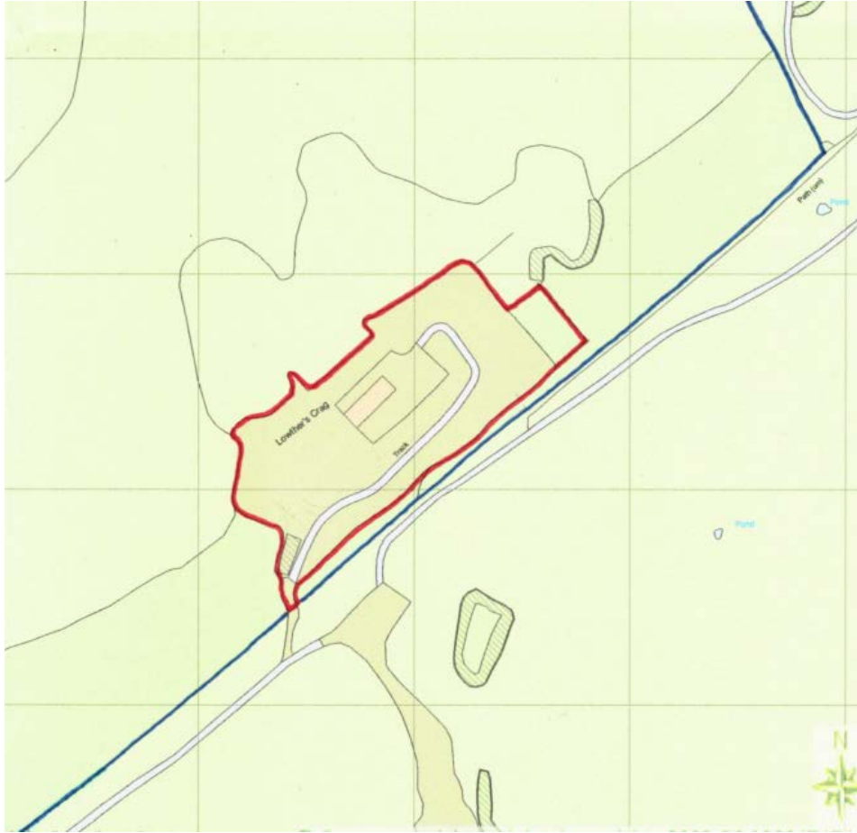
Fig 1: OS extract (NTS)