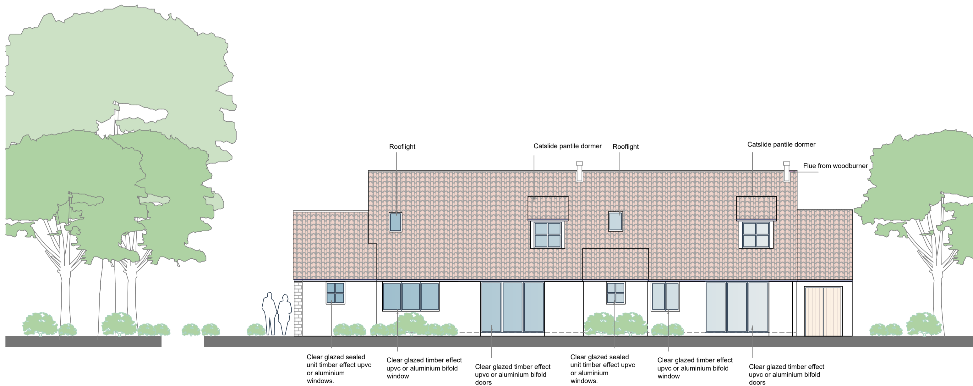
Proposed South West Elevation