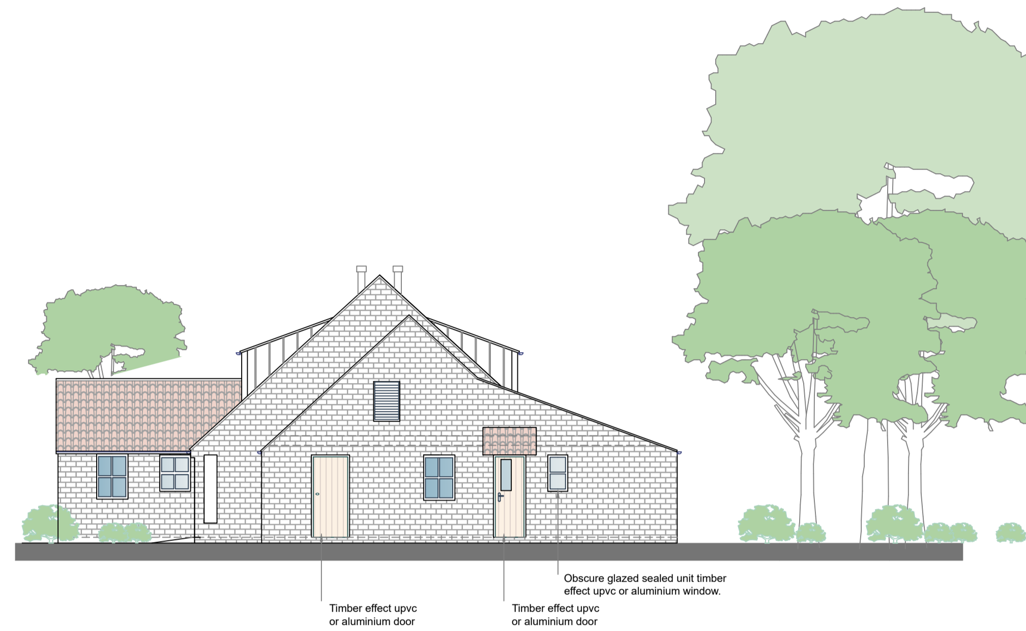
Proposed South East Elevation