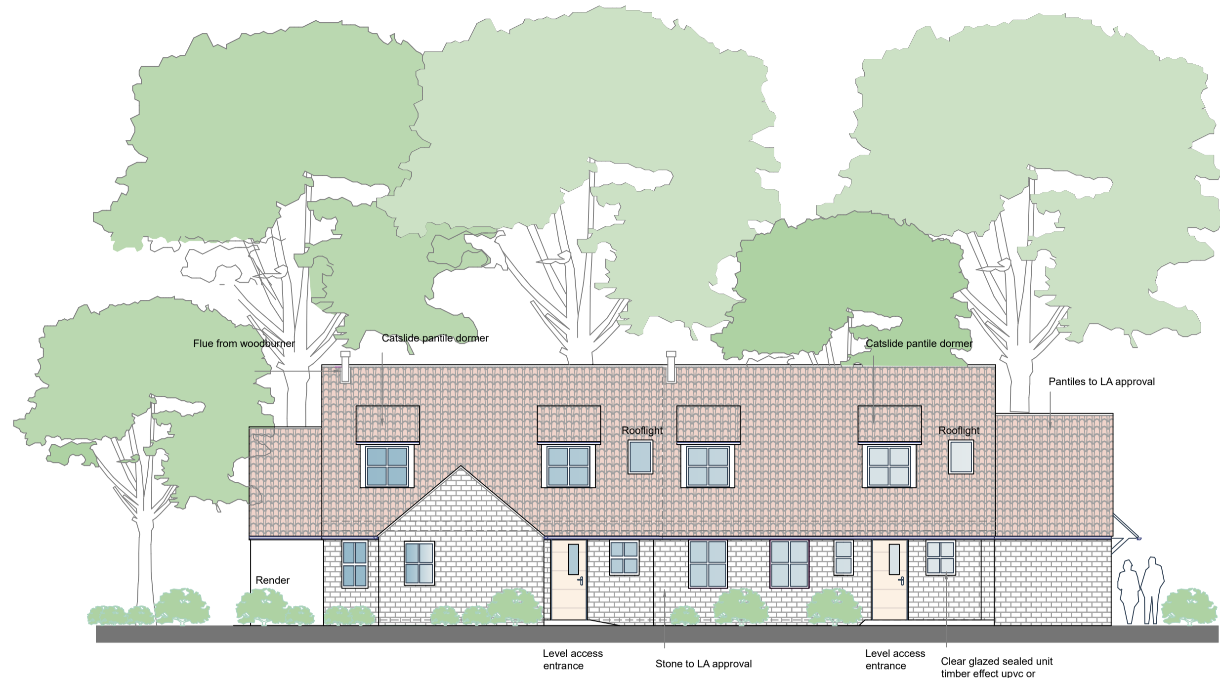
Proposed North East Elevation