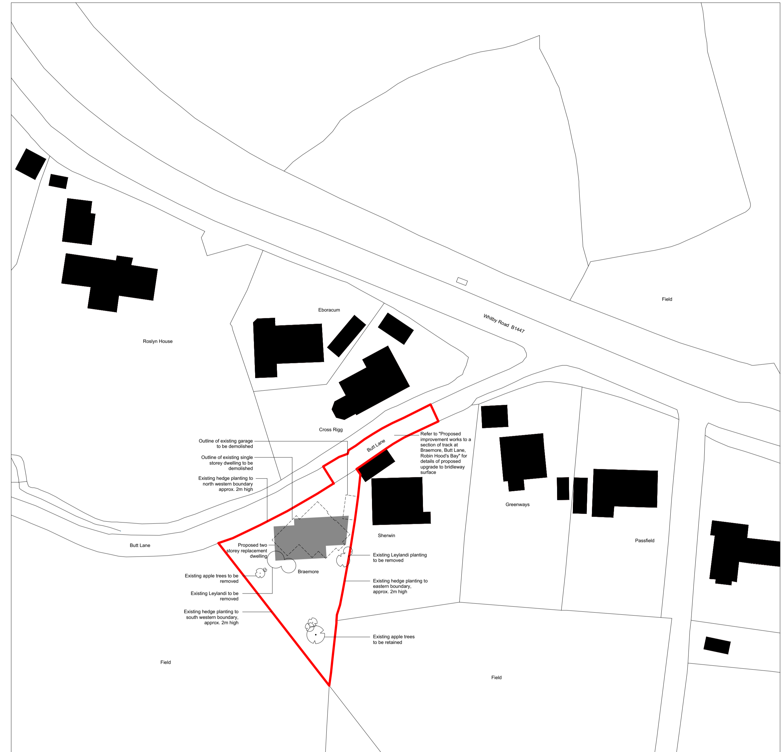
Site Plan 1:500 @ A1

OS Mastermap supplied by Emapsite License Ref: 869948