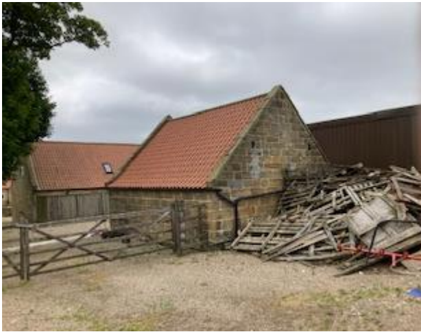
Fig 3. - Rear/side elevation of building to be re-purposed.