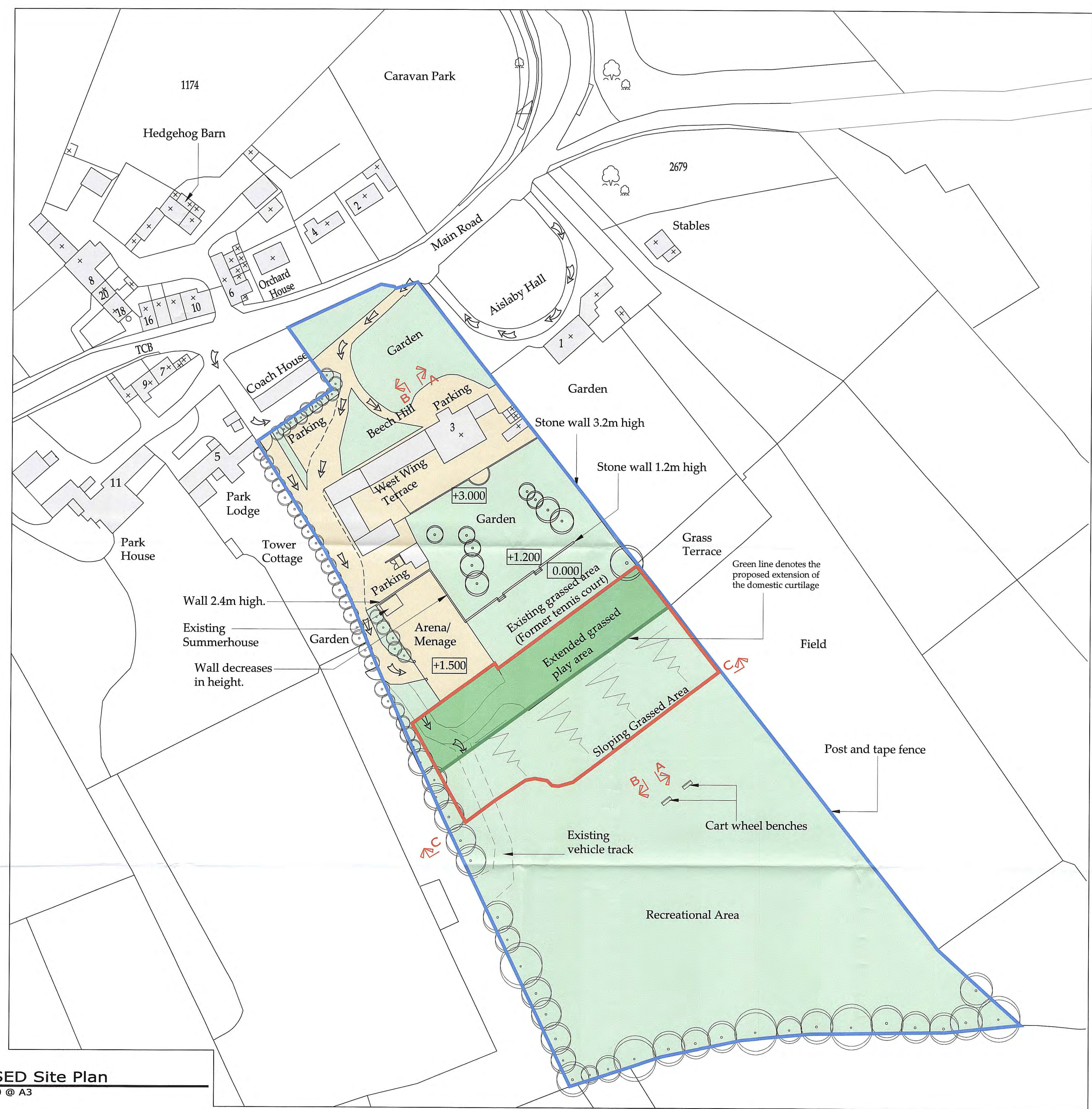
PROPOSED Site Plan Scale 1:1250 @ A3