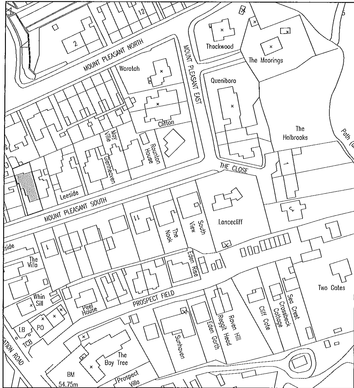
○ Site Plan Scale 1:1250