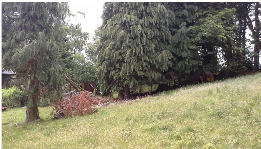
Fig 2. – Base of T8 and T9 to right of fallen limb