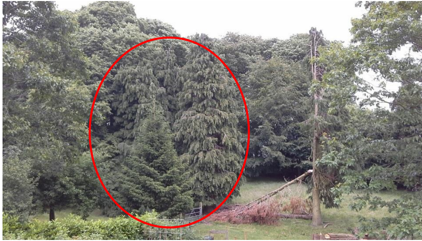
Fig 1. – T8 and T9 to the left of unprotected tree with broken limb – (not tree in forefront - Fir Tree)