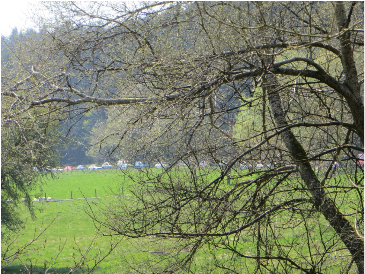
Traffic queuing on the Dalby Forest drive between Upper Dalby Wood and Nutwood 07/05/2018