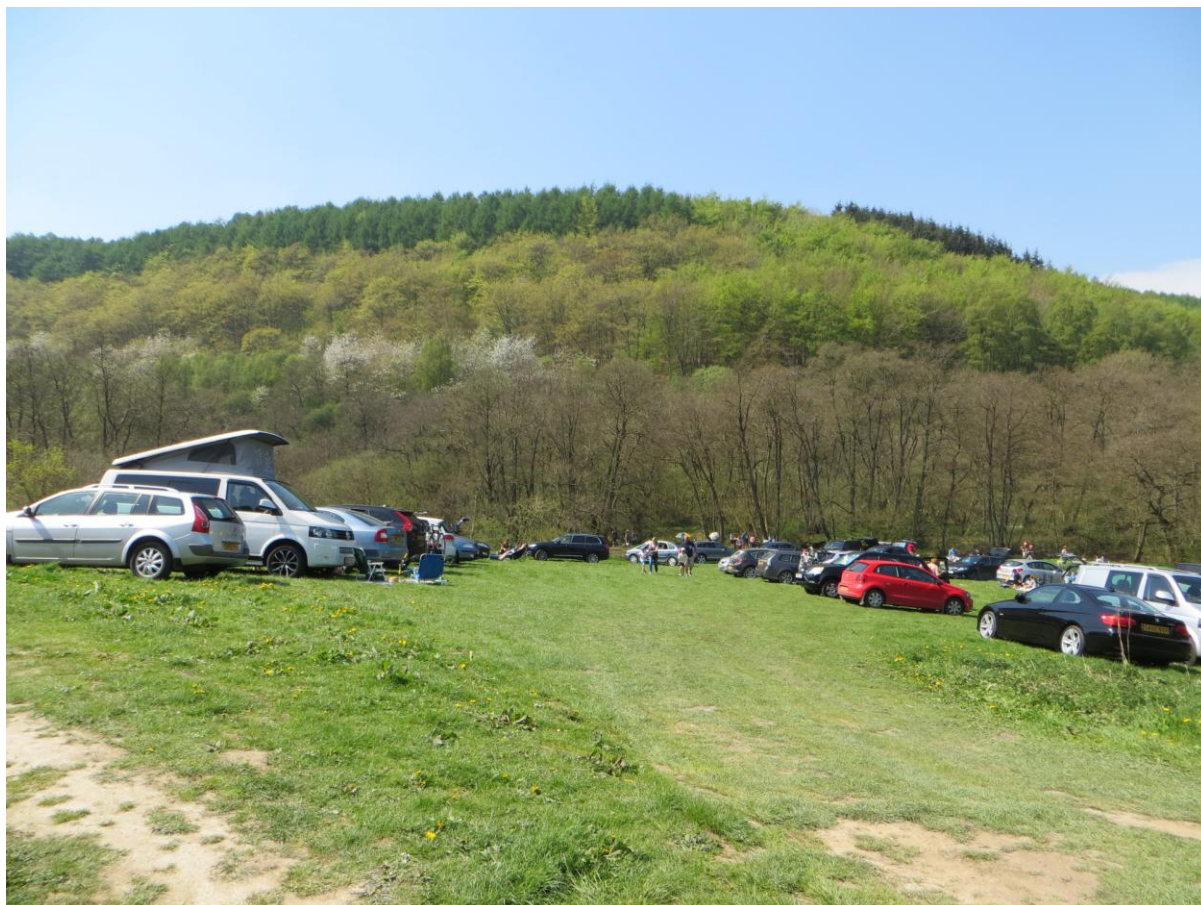
Adderstone field 07/05/2018