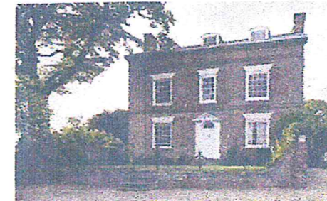
EXAMPLES OF ENGLISH COUNTRY HOUSES WITH SMALL DORMERS.