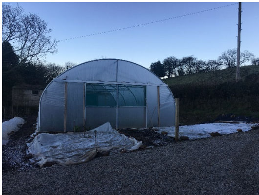
Polytunnel, looking east