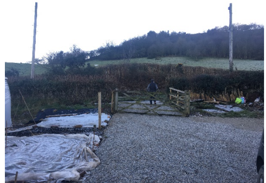
Entrance from within the site looking south