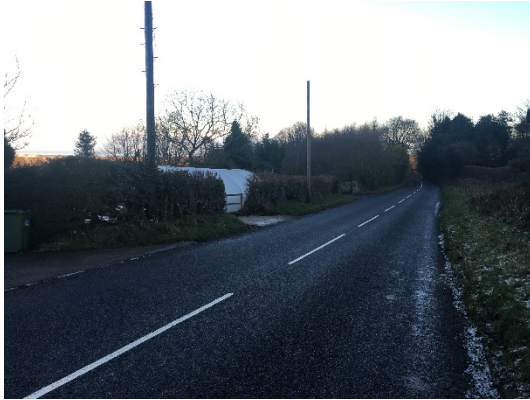
Polytunnel and new entrance from the west