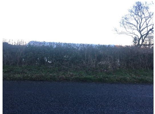
Polytunnel from the road looking north