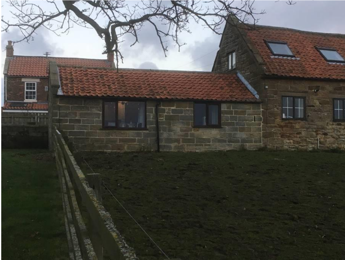
Fig 2. – Rear elevation of Chestnut Cottage, Stainsacre