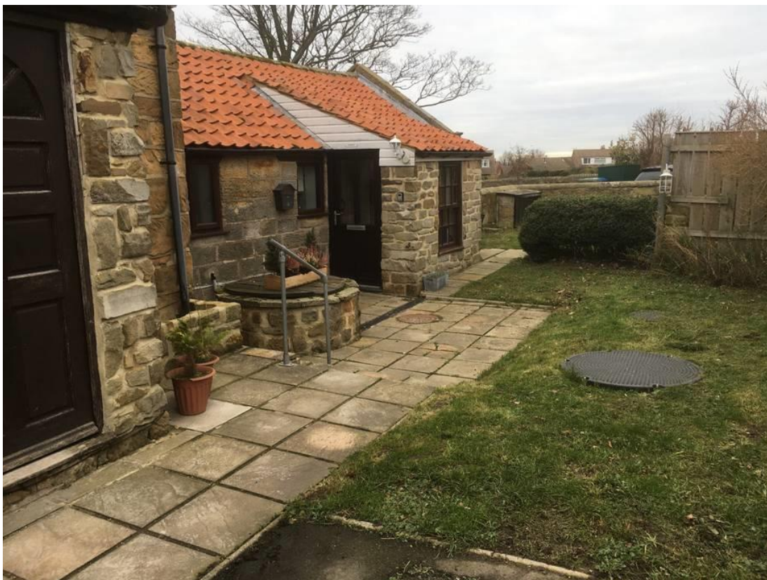
Fig 2. – Chestnut Cottage, Stainsacre – principle elevation